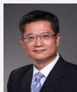
Hon Paul CHAN Mo-po, MH, JP (Accountancy*) (up to 28 July 2012)