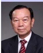
Hon LAU Wong-fat, GBM, GBS, JP (Heung Yee Kuk*)