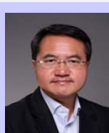
Hon LEE Wing-tat (New Territories West+)