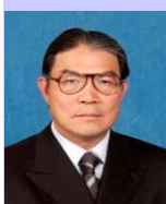
Hon Timothy FOK Tsun-ting, GBS, JP (Sports, Performing Arts, Culture and Publication*)