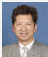
Hon Ronny TONG Ka-wah, SC (New Territories East+)