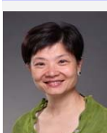
Hon Audrey EU Yuet-mee, SC, JP (Hong Kong Island+)