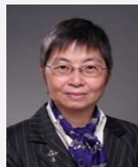
Dr Hon Margaret NG (Legal*)