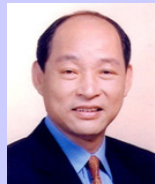
Hon CHEUNG Hok-ming, GBS, JP (New Territories West+)