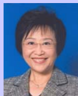
Hon Miriam LAU Kin-ye, GBS, JP (Transport*)