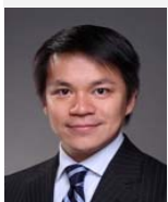
Hon CHAN Hak-kan, JP (New Territories East+)