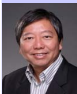
Hon LEE Cheuk-yan (New Territories West+)