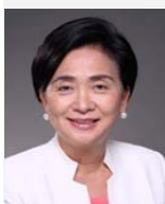
Hon Emily LAU Wai-hing, JP (New Territories East+)