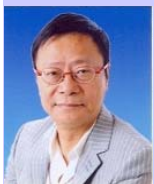
Hon WONG Yuk-man (Kowloon West+) (up to 28 January 2010) (since 17 May 2010)

* Functional Constituency + Geographical Constituency