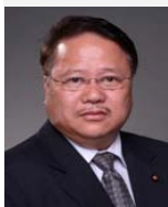
Hon WONG Yung-kan, SBS, JP (Agriculture and Fisheries*)