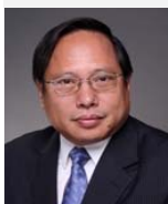
Hon Albert HO Chun-yan (New Territories West+)