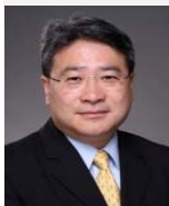
Hon Fred LI Wah-ming, SBS, JP (Kowloon East+)