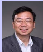
Hon CHEUNG Man-kwong (Education*)