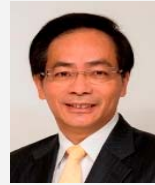
Hon IP Kwok-him, GBS, JP (District Council*)