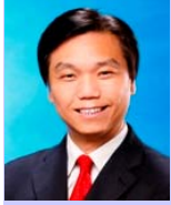
Hon WONG Sing-chi (New Territories East+)