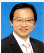
Hon KAM Nai-wai, MH (Hong Kong Island+)