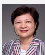
Hon LI Fung-ying, SBS, JP (Labour*)