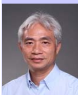
Hon LEUNG Yiu-chung (New Territories West+)