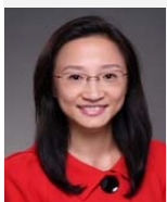
Hon Tanya CHAN (Hong Kong Island+) (up to 28 January 2010) (since 17 May 2010)