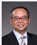
Hon LAU Kong-wah, JP (New Territories East+)