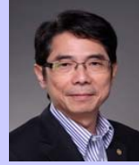
Hon WONG Kwok-kin, BBS (Kowloon East+)