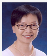
Hon Cyd HO Sau-lan (Hong Kong Island+)