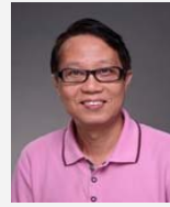
Hon CHEUNG Kwok-che (Social Welfare*)