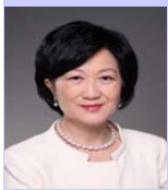
Hon Mrs Regina IP LAU Suk-ye, GBS, JP (Hong Kong Island+)