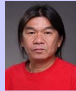
Hon LEUNG Kwok-hung (New Territories East+) (up to 28 January 2010) (since 17 May 2010)