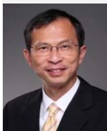
Hon Jasper TSANG Yok-sing, GBS, JP (Hong Kong Island+)