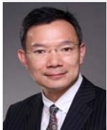
Hon Paul TSE Wai-chun, JP (Tourism*)