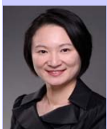
Hon Starry LEE Wai-king, JP (Kowloon West+)