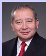
Dr Hon David LI Kwok-po, GBM, GBS, JP (Finance*)