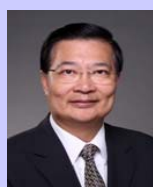
Hon TAM Yiu-chung, GBS, JP (New Territories West+)