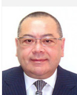
Hon Abraham SHEK Lai-him, SBS, JP (Real Estate and Construction*)