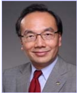
Hon Alan LEONG Kah-kit, SC (Kowloon East+) (up to 28 January 2010) (since 17 May 2010)