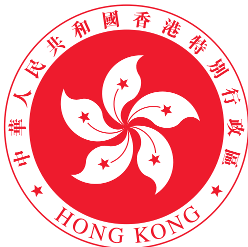
The Design of the Regional Emblem of the Hong Kong Special Administrative Region