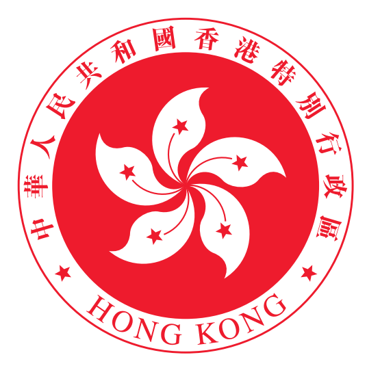
The Design of the Regional Emblem of the Hong Kong Special Administrative Region