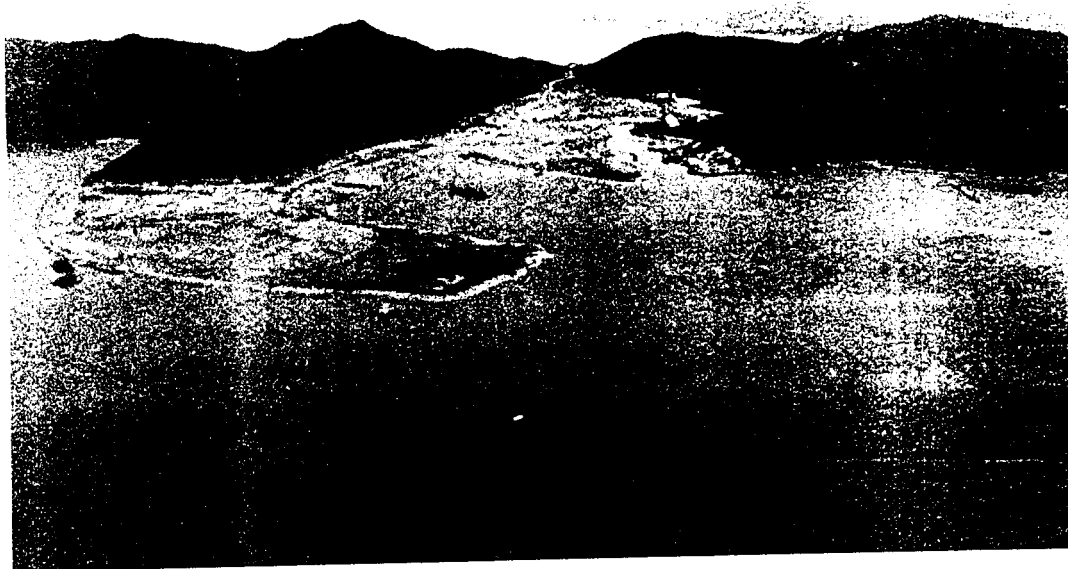
Reclamation Works at Penny's Bay (Outer Bay View) (Progress as at end-November 2001) 竹篙灣（外灣）填海工程進度（截至二零零一年十一月底）