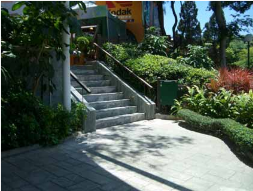
(staircase leading from Cable Car Plaza upper platform to the lower platform sitting-out area)