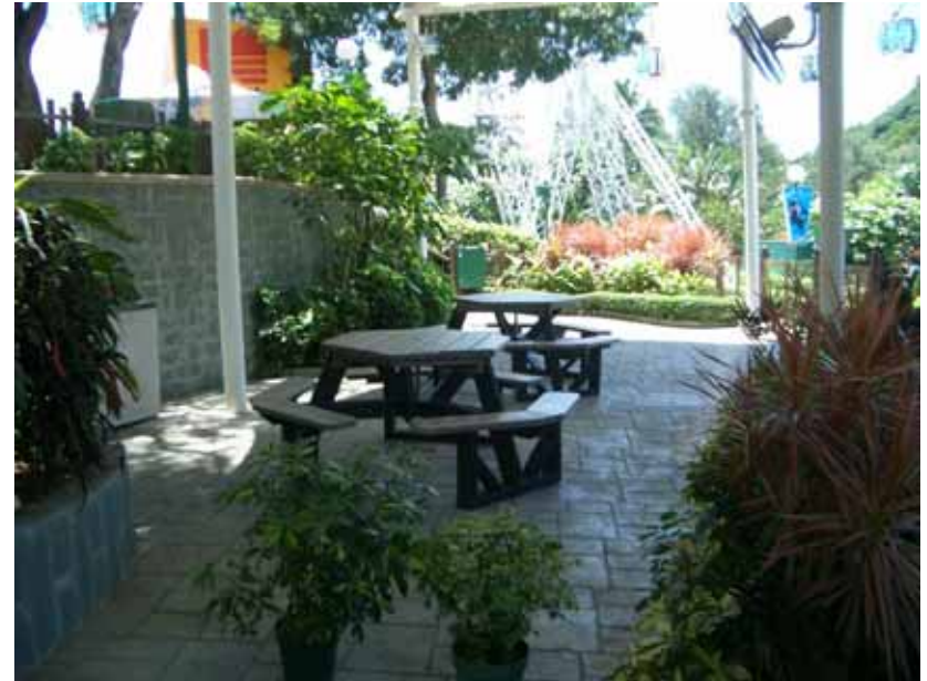
(the lower platform sitting-out area)