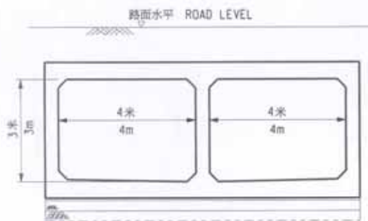
雙管箱形暗渠橫截面圖 TYPICAL CROSS SECTION OF TWIN CELL BOX CULVERT