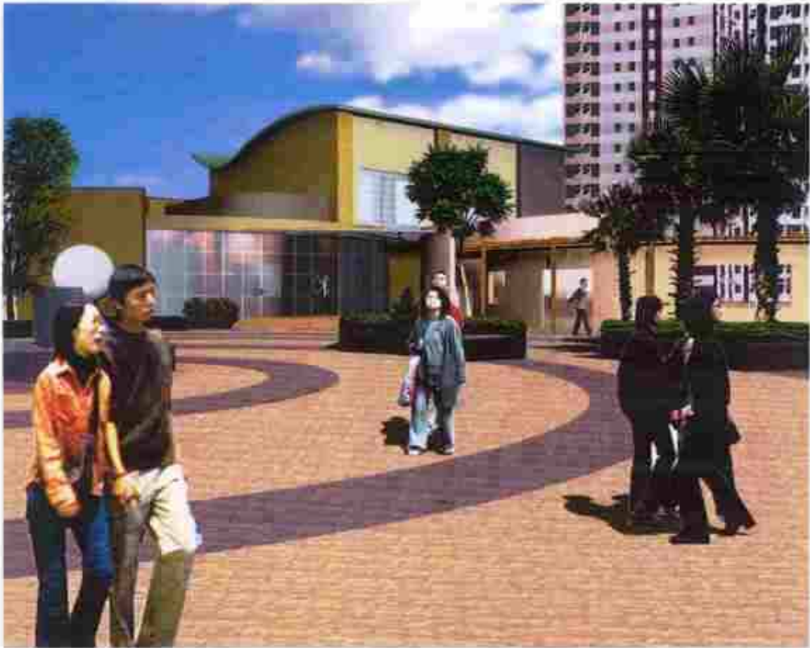
從東南面望向擬建社區會堂的構思圖 VIEW OF THE PROPOSED COMMUNITY HALL FROM THE SOUTH-EAST DIRECTION