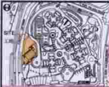
位置圖 LOCATION PLAN (比例尺 1:5000)