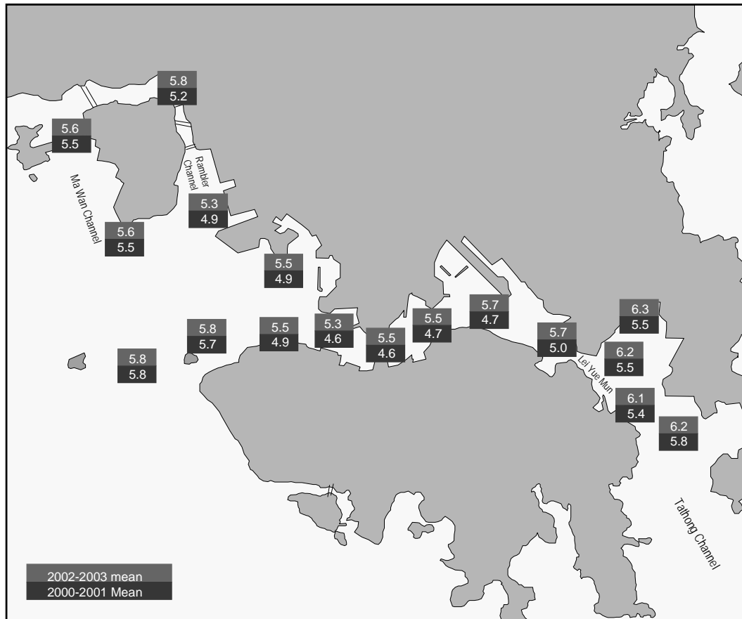
Figure 2 Map showing changes in dissolved oxygen (mg/L) at 17 stations in the HATS enhanced monitoring (comparison of mean difference between Jan 2002 – Dec 2003 and Jan 2000 – Dec 2001)