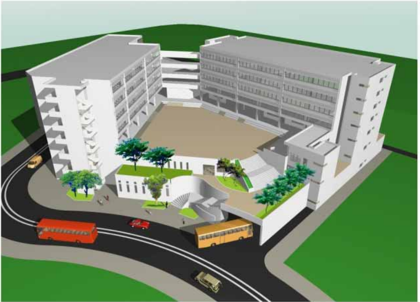
VIEW OF THE SCHOOL PREMISES FROM NORTHERN DIRECTION (AERIAL VIEW) 從北面望向校舍的鳥瞰效果圖

54EC - A PRIVATE INDEPENDENT SCHOOL (SECONDARY-CUM-PRIMARY) IN AREA 11, SHA TIN 沙田第11區的1所私立獨立學校(中學暨小學)