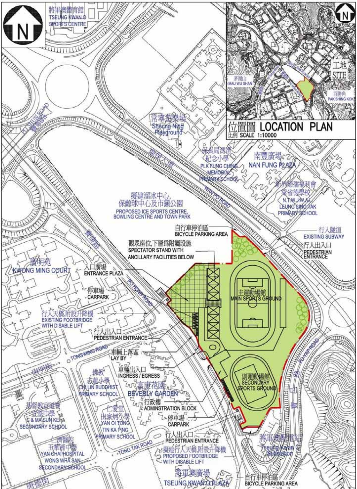
位置圖 LOCATION PLAN 比例 SCALE 1:10000