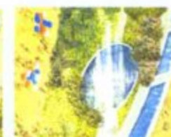
Musical fountain 音樂噴泉