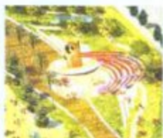
Amphitheatre and Outdoor forums 露天劇場及論壇場地