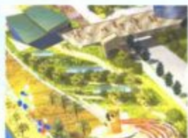
Undulating lawn 起伏有致的草坪