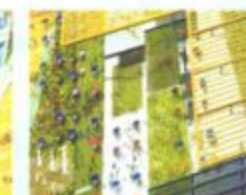
Alfresco dining, cafes and outdoor plaza on timber deck 露天茶座、餐廳 及在木板上的露天廣場