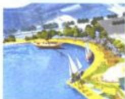
Marine Basin 海港內灣