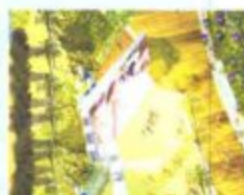
Outdoor media show and Performance stage 戶外媒體節目及表演場地