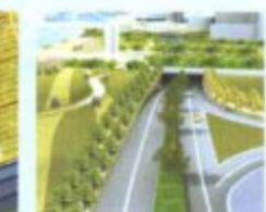
Tree-lined boulevard and at-grade landscaped deck 林蔭道路及地面面景平台