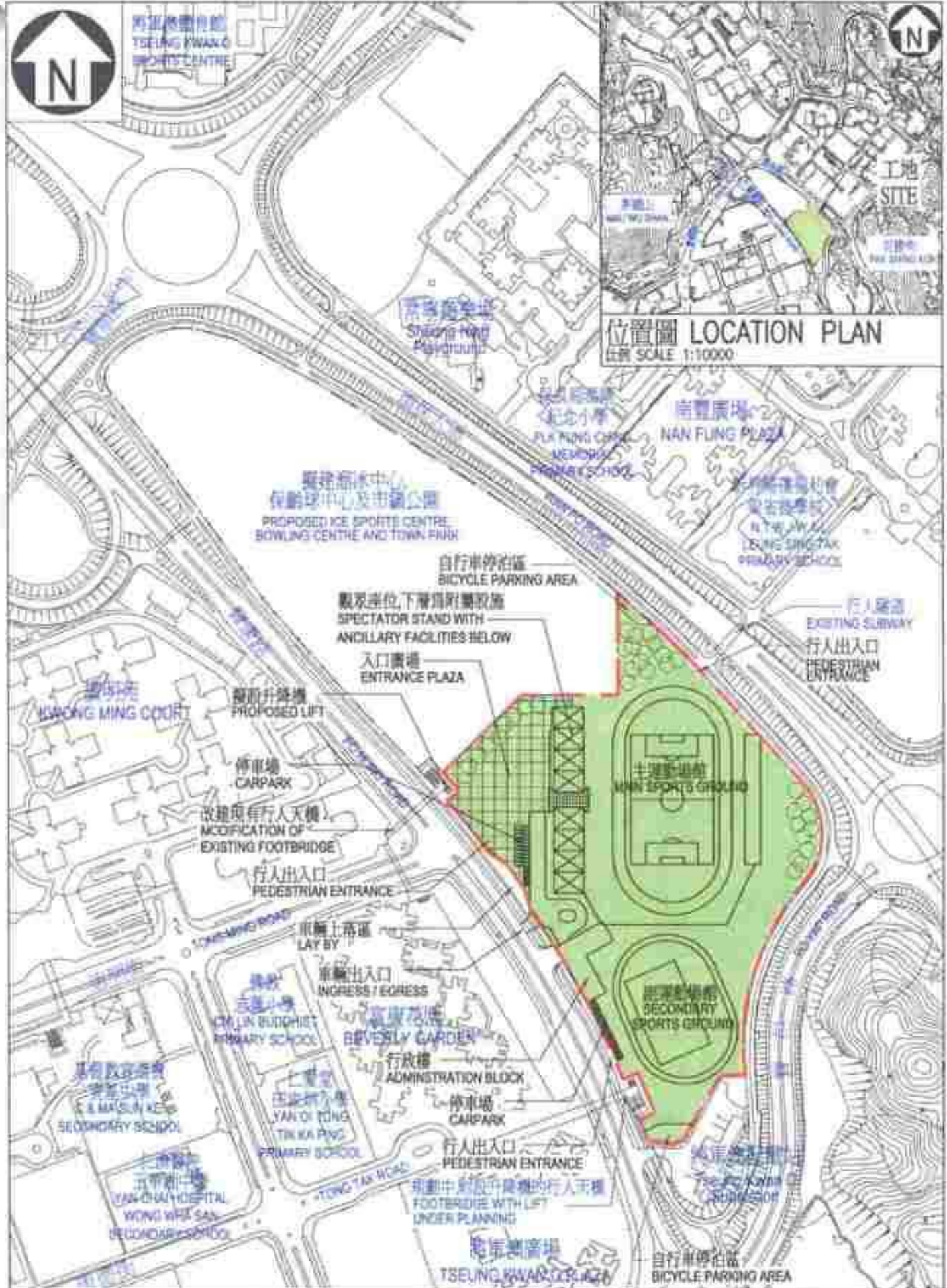
位置圖 LOCATION PLAN 比例 SCALE 1:10000