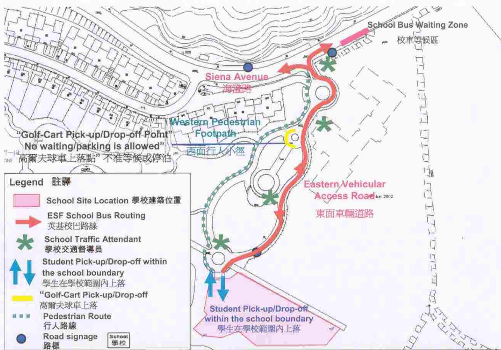
Operation of School Bus and Golf Cart during School Operation 學校運作期間校巴及高爾夫球車的運作