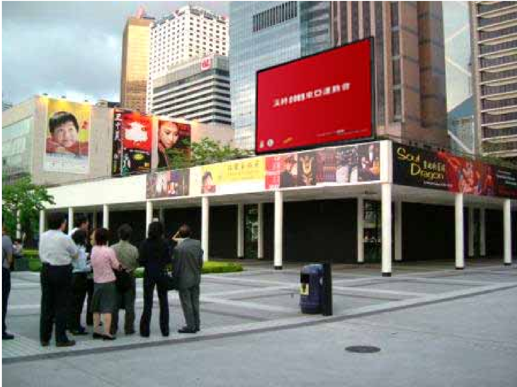
City Hall (facing Queen's Pier) with LED Display