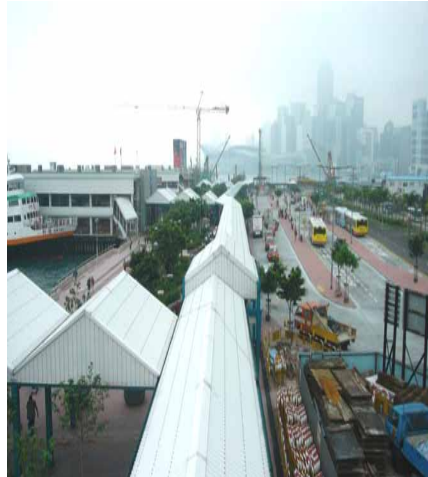
Waterfront at IFC