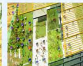
Alfresco dining, cafes and outdoor plaza on timber deck 露天茶座、餐廳 及在木板上的露天廣場