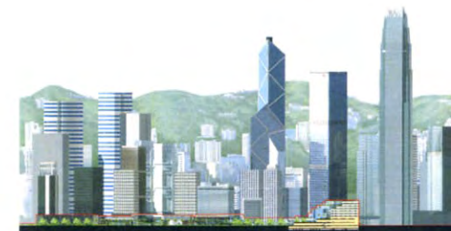
Section BB' through CDA Site from IFC II to the harbourfront