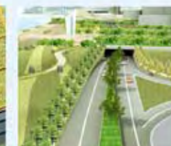
Tree-lined boulevard and at-grade landscaped deck 林蔭道路及地面園景平台