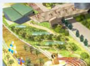
Undulating lawn 起伏有致的草坪