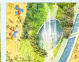
Musical fountain 音樂噴泉