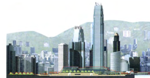
Section AA' through CDA Site from Statue Square to New Star Ferry Piers