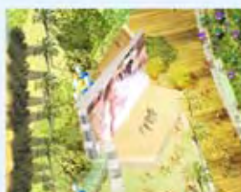
Outdoor media show and Performance stage 戶外媒體節目及表演場地