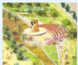
Amphitheatre and Outdoor forums 露天劇場及論壇場地