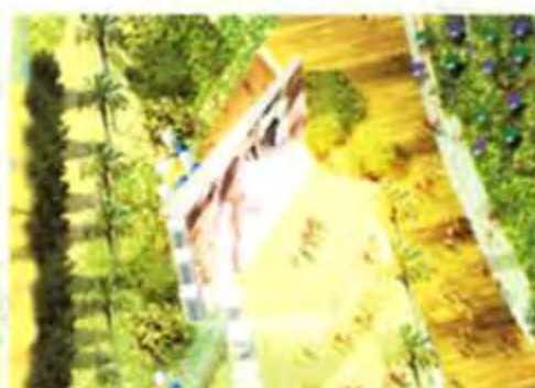
Outdoor Media Show and Performance Stage