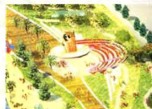
Amphitheatre and Outdoor Forums