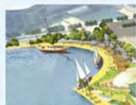
Marine Basin 海港內灣