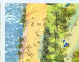
Harbour walkway 海濱走廊