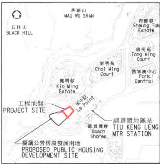
位置圖 LOCATION PLAN 比例 SCALE 1 : 20 000