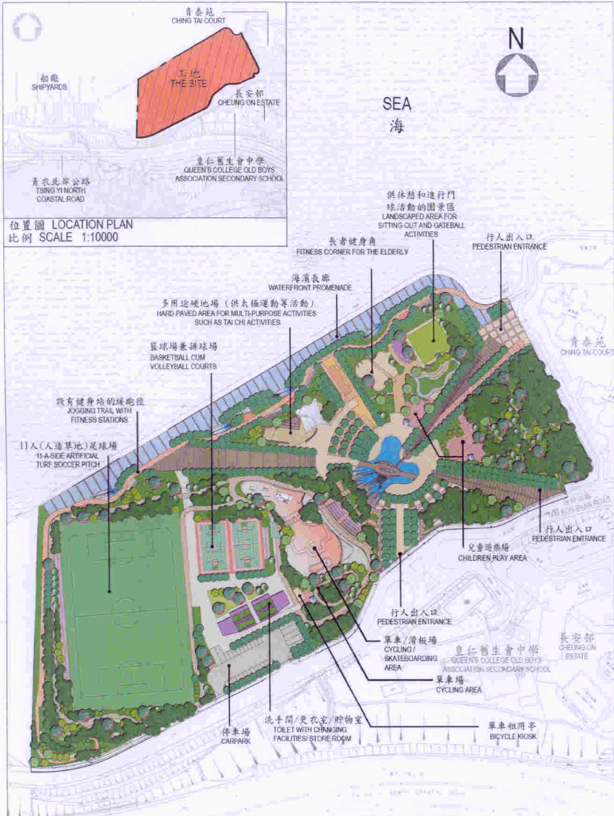
位置圖 LOCATION PLAN 比例 SCALE 1:10000