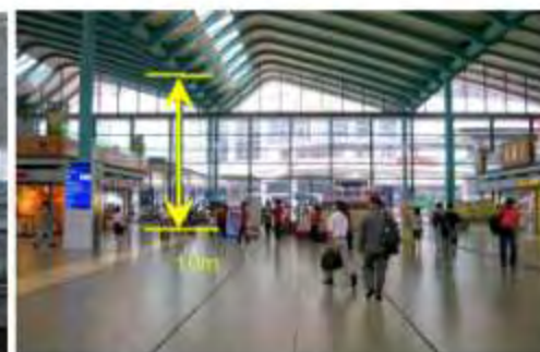
KCR East Rail Hung Hom Station Lobby