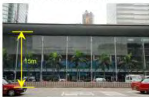
Airport Railway Hong Kong Station