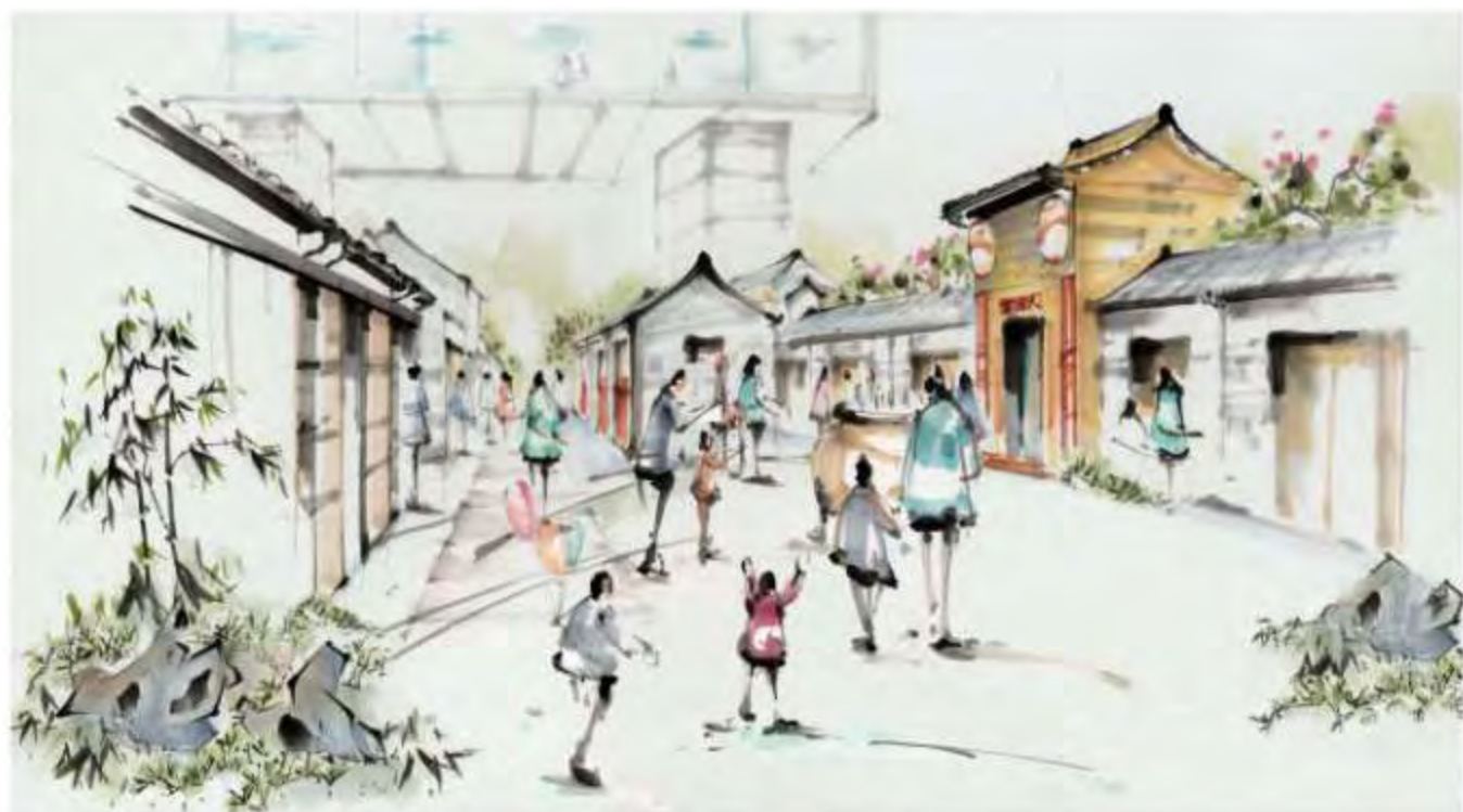
Forecourt of Tin Hau Temple