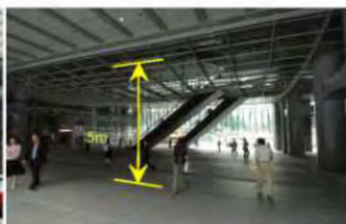
HSBC Headquarter Lobby