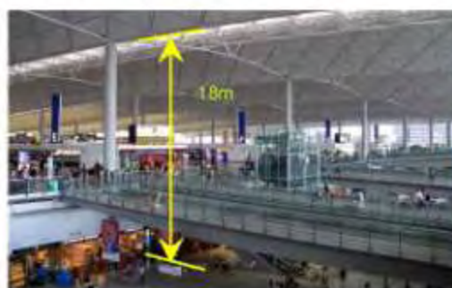
Hong Kong International Airport Lobby