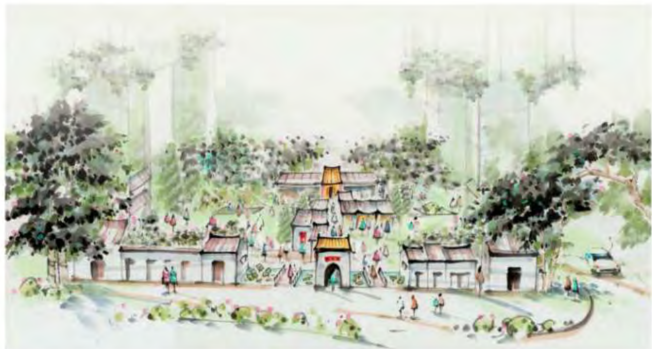
View from Kai Tak Nullah