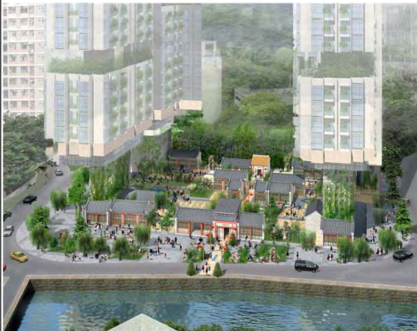
View from Kai Tak Nullah