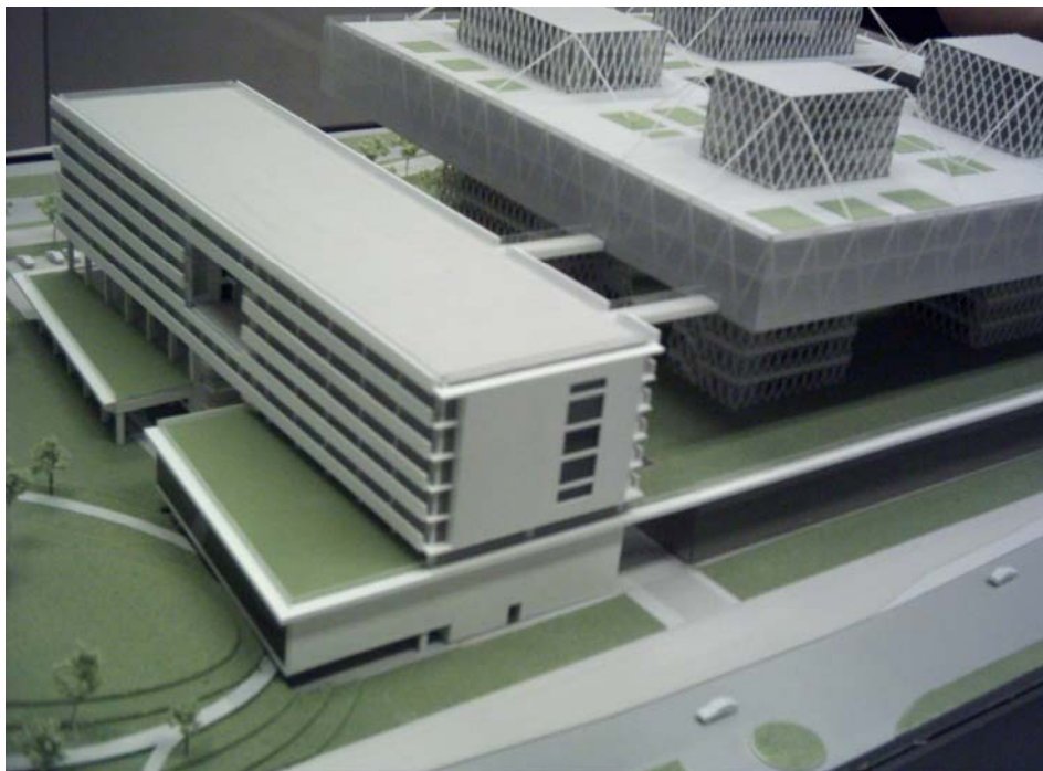
Artist's Impression of VTC campus at Tiu Keng Leng 職業訓練局調景嶺新校園