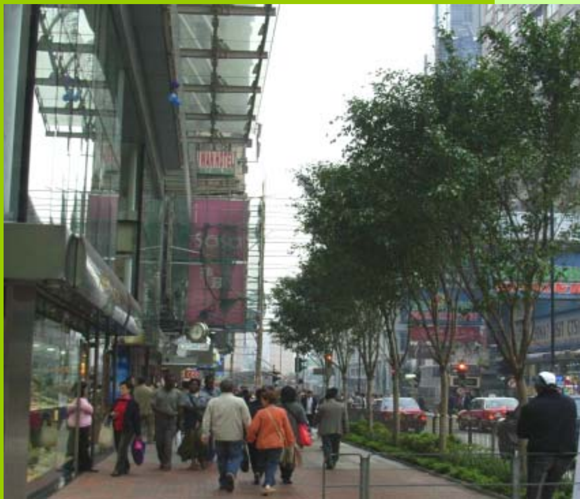
Nathan Road near Mody Road 彌敦道近麼地道