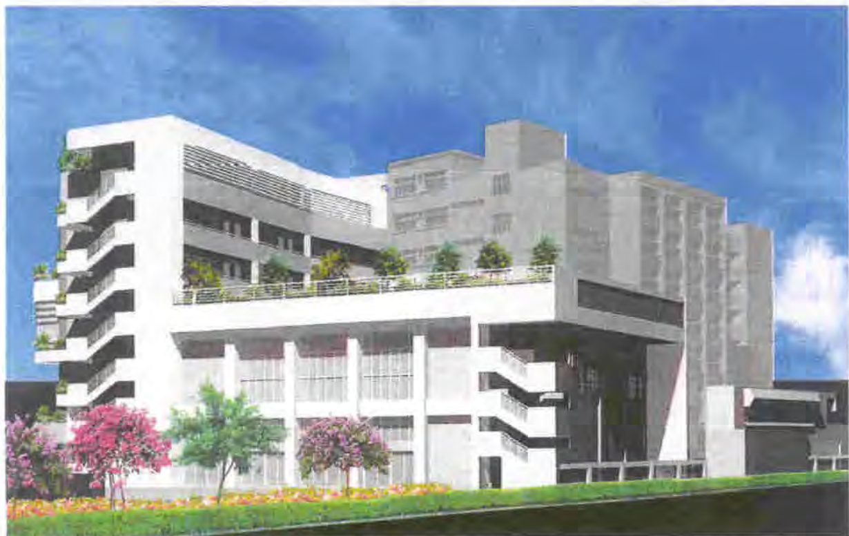
VIEW OF THE SCHOOL PREMISES FROM NORTHERN DIRECTION (ARTIST'S IMPRESSION) 從北面望向校舍的構思圖