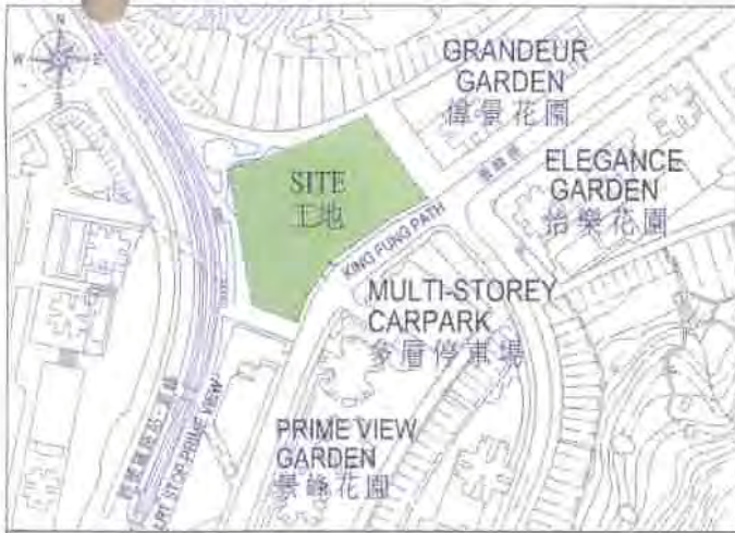
位置圖 LOCATION PLAN