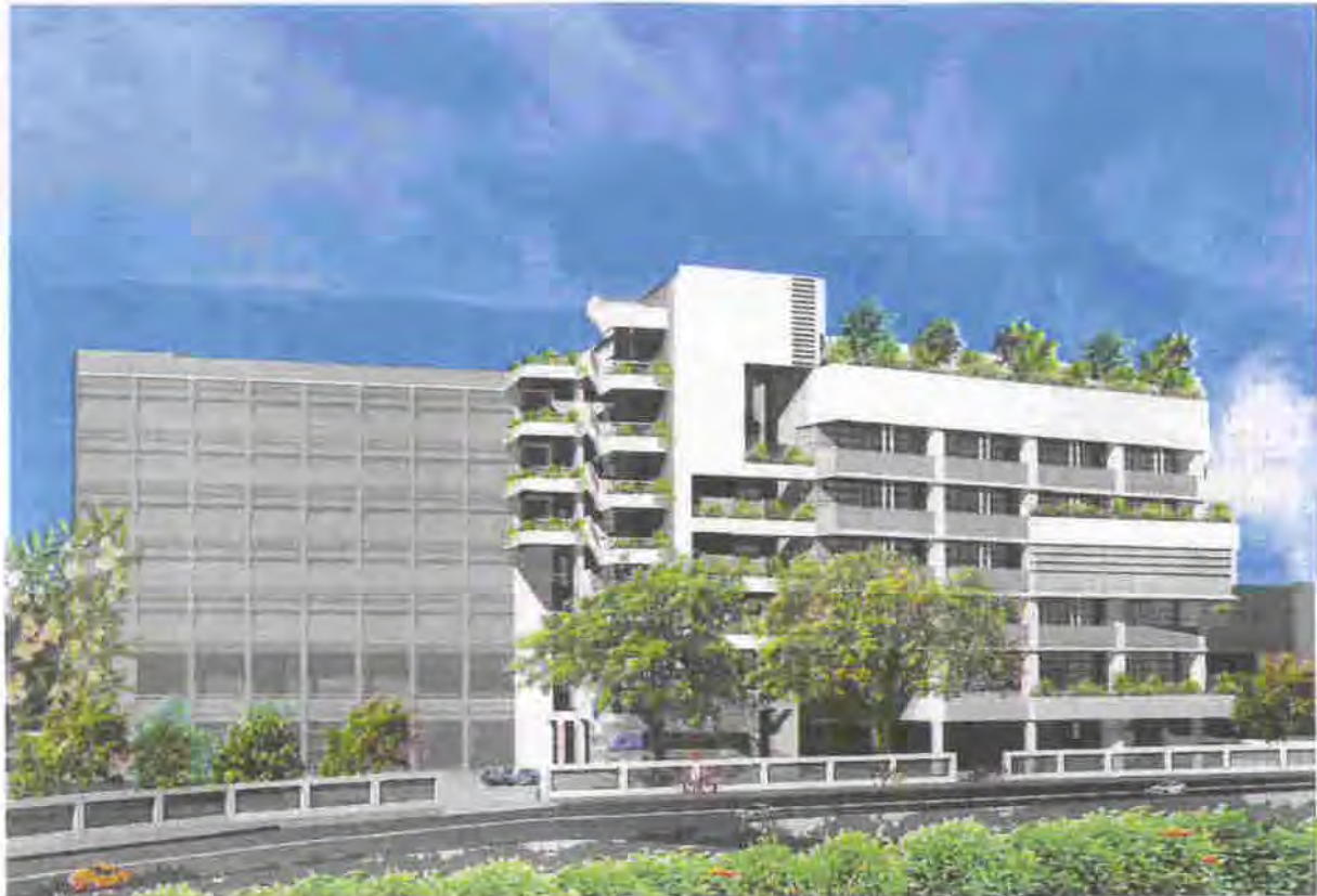
VIEW OF THE SCHOOL PREMISES FROM SOUTHERN DIRECTION (ARTIST'S IMPRESSION) 從南面望向校舍的構思圖