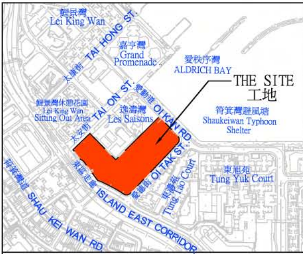
位置圖 LOCATION PLAN 比例 SCALE : 1:10000