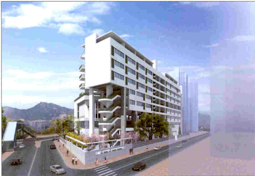
VIEW OF THE SCHOOL PREMISES FROM SOUTH-WESTERN DIRECTION (ARTIST'S IMPRESSION) 從西南面望向校舍的構思圖

31EA Redevelopment of St Rose of Lima's School at Embankment Road and Duke Street, Kowloon 九龍基堤道及公爵街聖羅撒學校重建計劃