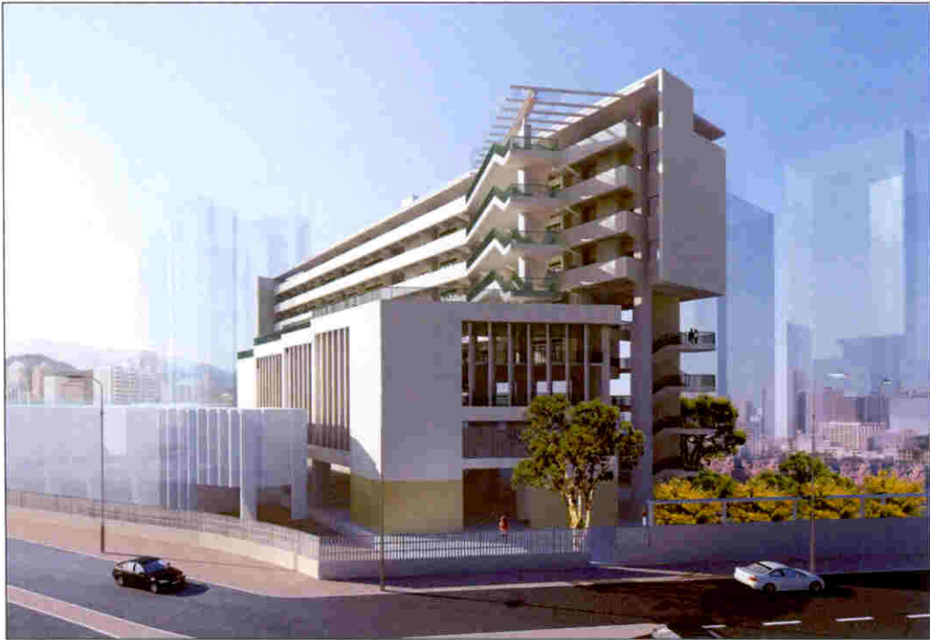
VIEW OF THE SCHOOL PREMISES FROM NORTH-WESTERN DIRECTION (ARTIST'S IMPRESSION) 從西北面望向校舍的構思圖