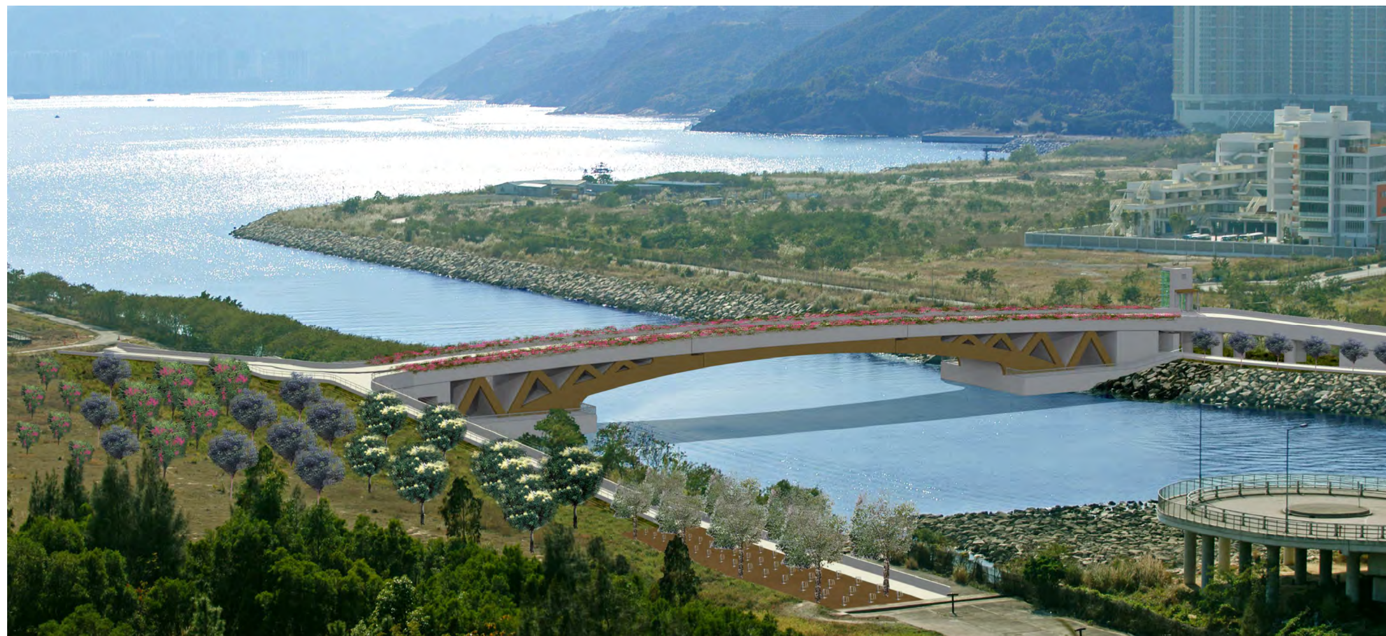
Perspective View of Completed Bridge and Surrounding Landscape Works 天橋及附近的園林設計完成後的透視圖