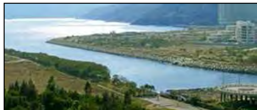
Existing Environment 現有環境