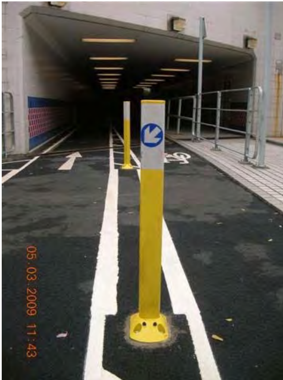
相片2 – 地點：火炭路與源禾路交界處的行人隧道 Photo 2 – Location: Subway at Fo Tan Road at the junction with Yuen Wo Road