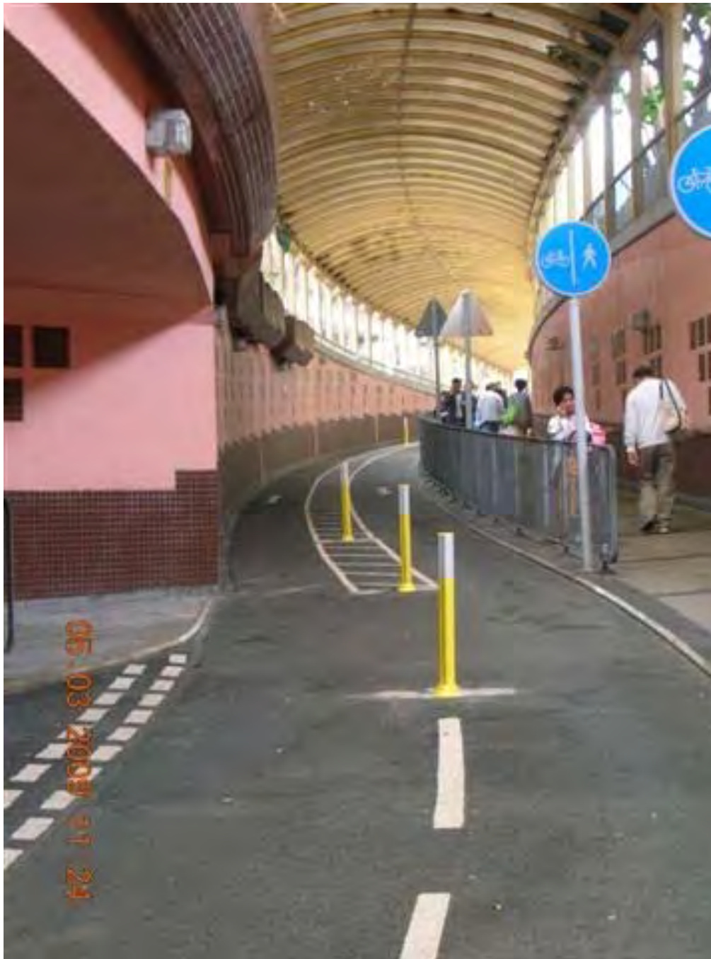
相片 1 – 地點：馬鞍山的行人隧道 Photo 1 – Location：Subway at Ma On Shan