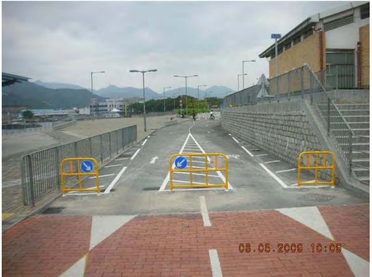
相片 3 – 地點：馬料水渡輪碼頭 Photo 3 – Location：Ma Liu Shui Ferry Pier