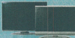
Sharp 37" LCD TV (LC-37PX5H) and Sharp 32" LCD TV (LC-32BX5H)