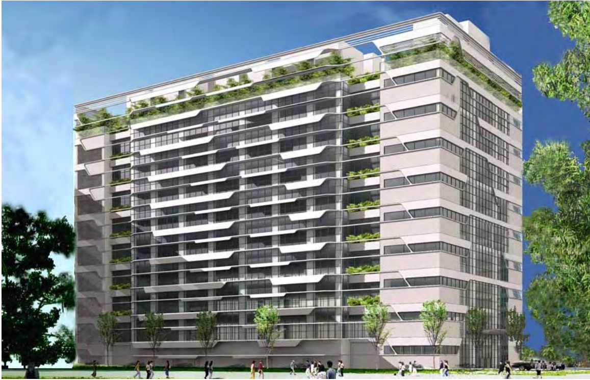
View of the building from southern direction (Artist's impression) 從南面望向大樓的構思圖