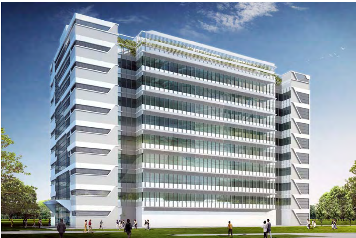
View of the building from northern direction (Artist's impression) 從北面望向大樓的構思圖