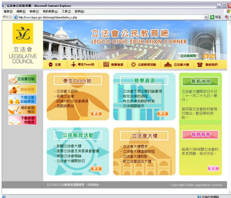
The new and enhanced "Civic Education Corner" consists of four main themes, namely "Youth Corner", "Teaching Resources", "Civic Education Programmes", and "LegCo Building".