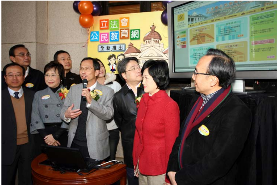
The President of the Legislative Council, Mr Jasper Tsang Yok-sing (fifth from left) introduces the features of the "Civic Education Corner" to the visitors.