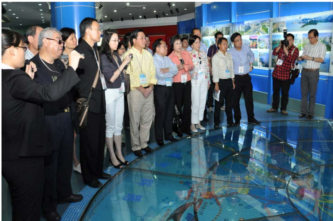
Delegation members are briefed on the development of Zhuhai before meeting with Zhuhai Government officials to understand how they incorporate greening plans with the city's town planning strategy.