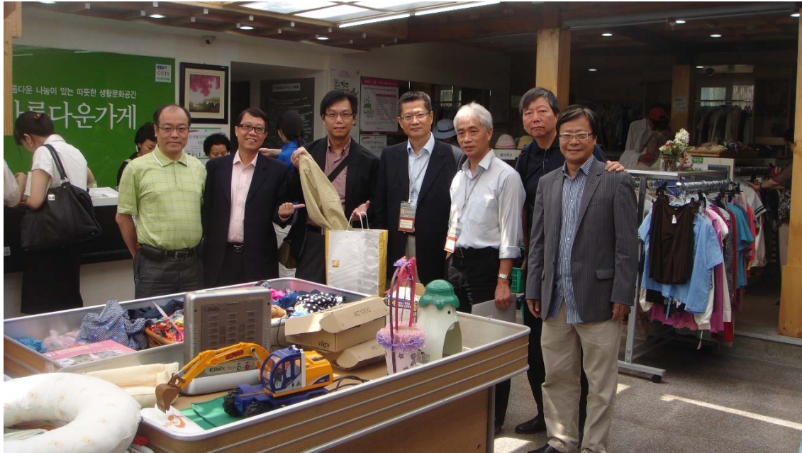
The delegation visited the Beautiful Store to understand the experience in operating social enterprise in the city.