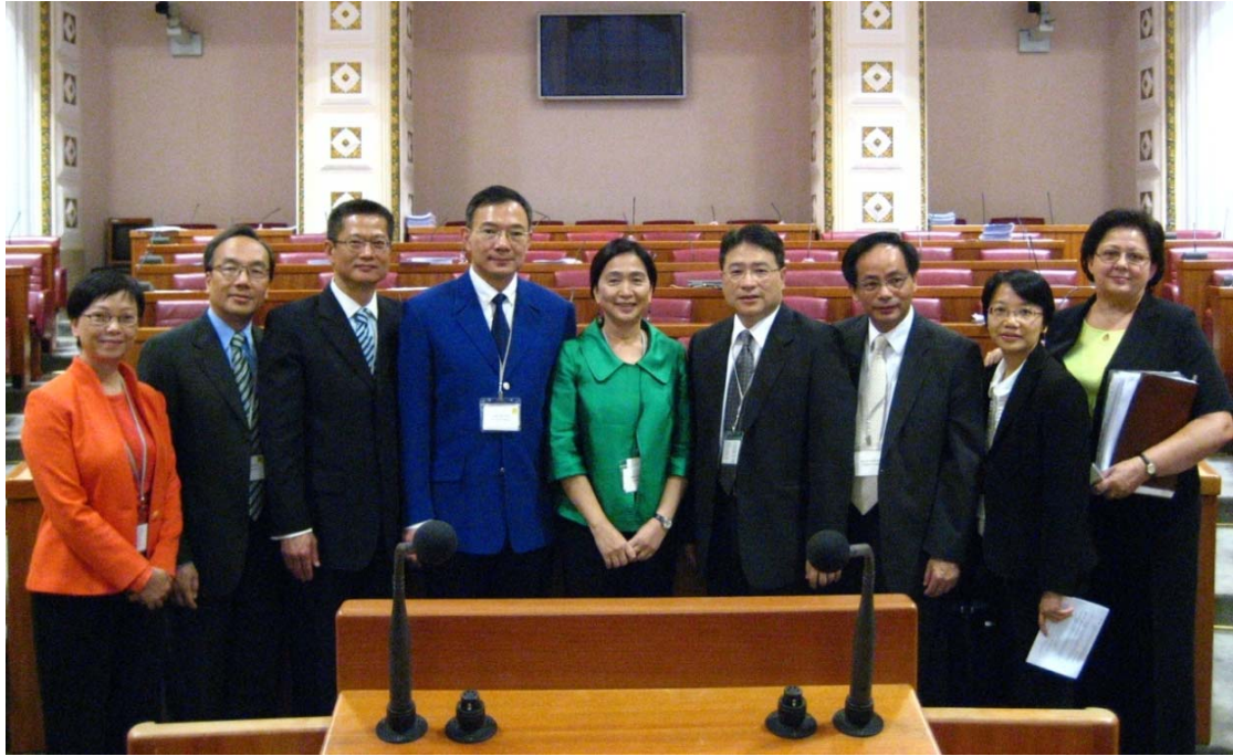
The delegation toured the Chamber of the Croatian Parliament.