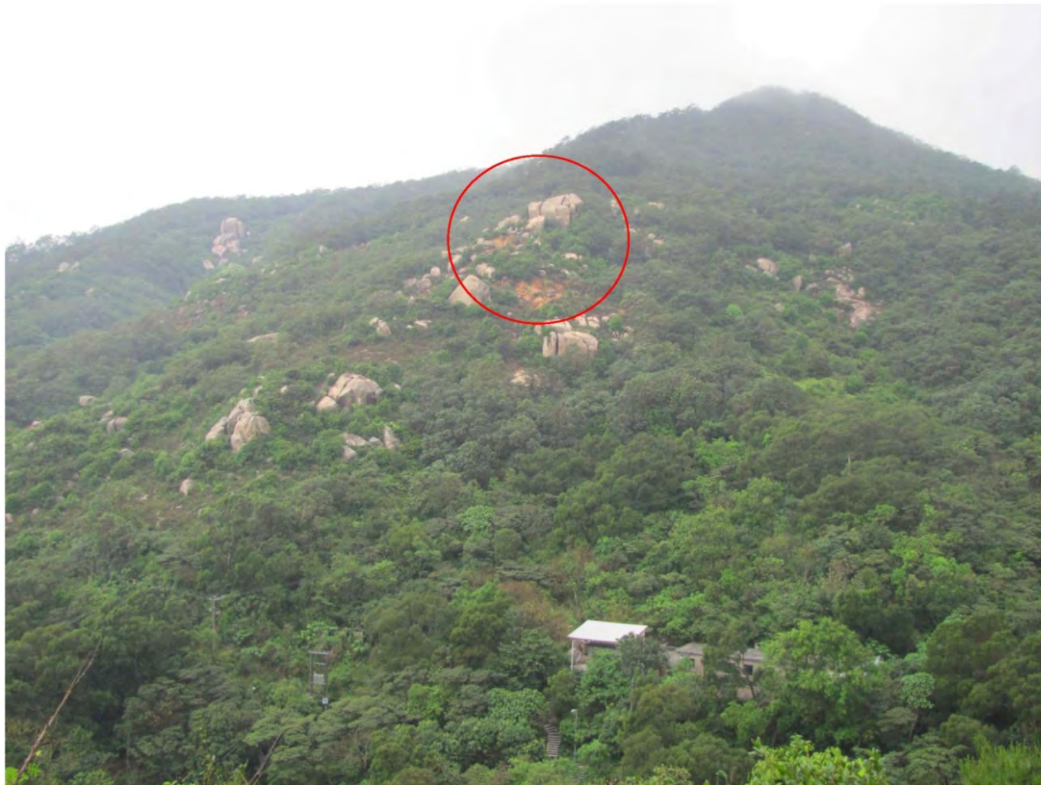
Western Natural Hillside 西面之天然山坡