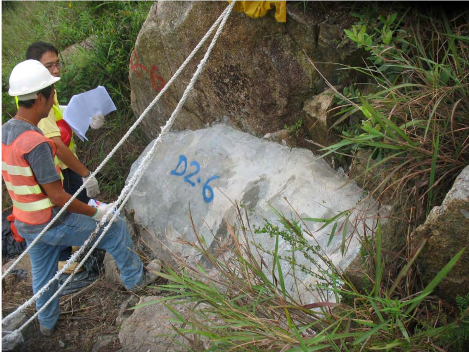
Concrete Buttress (Example at Discovery Bay)