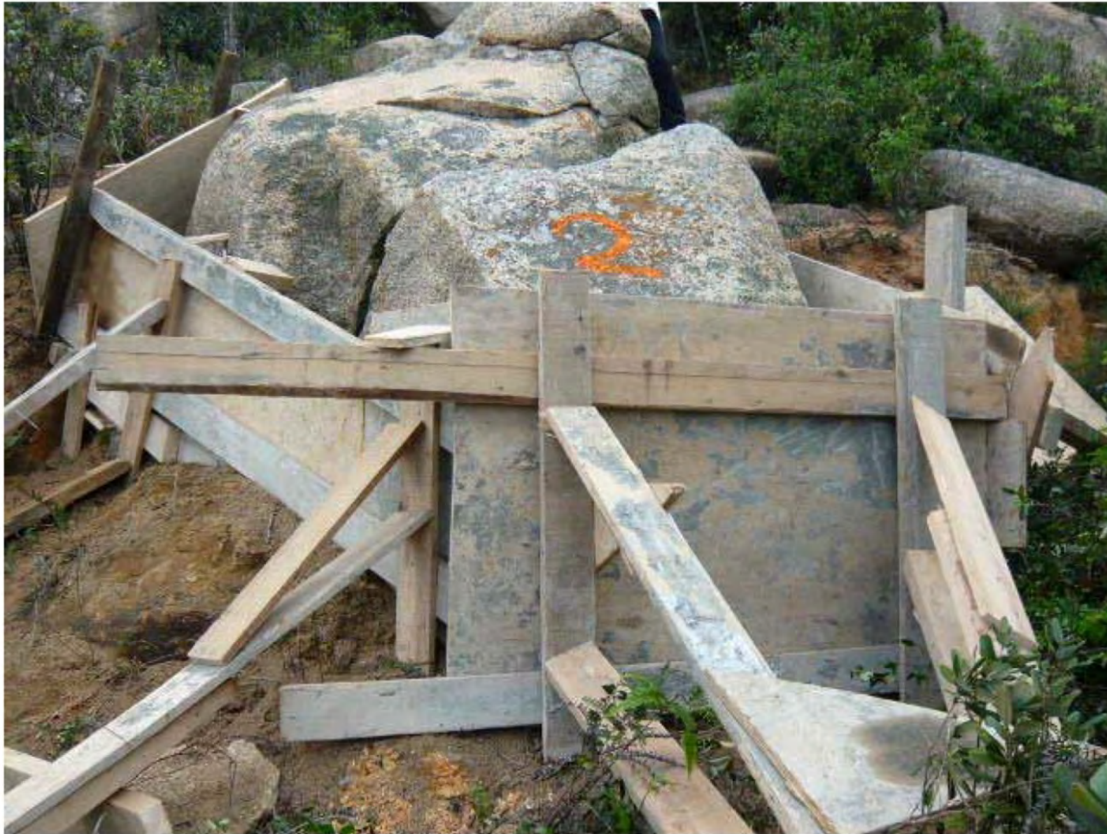
Boulder 2 - Stabilization Works in Progress (Formwork Erected)