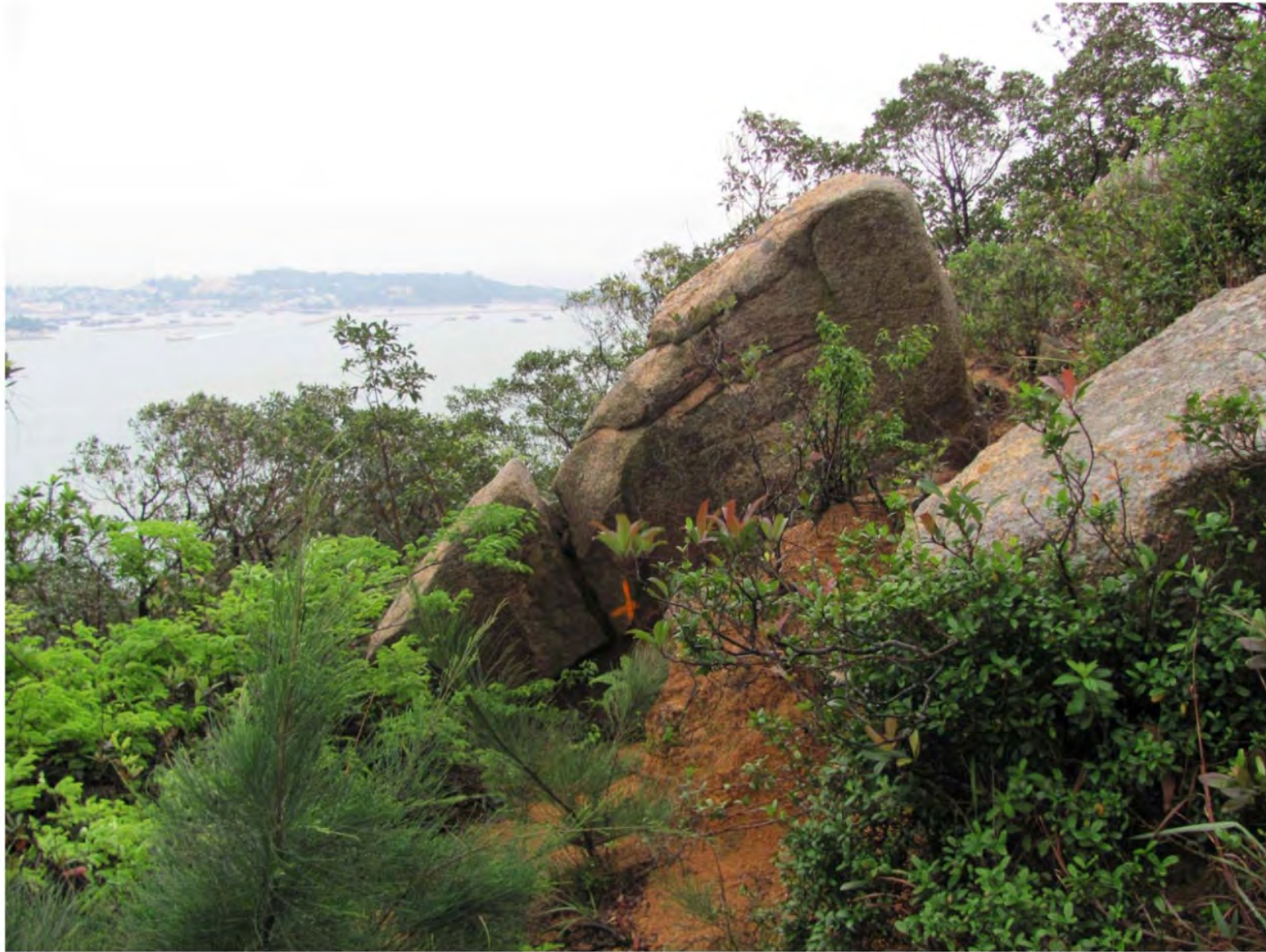
Boulder 2 (Before Stabilization Works)