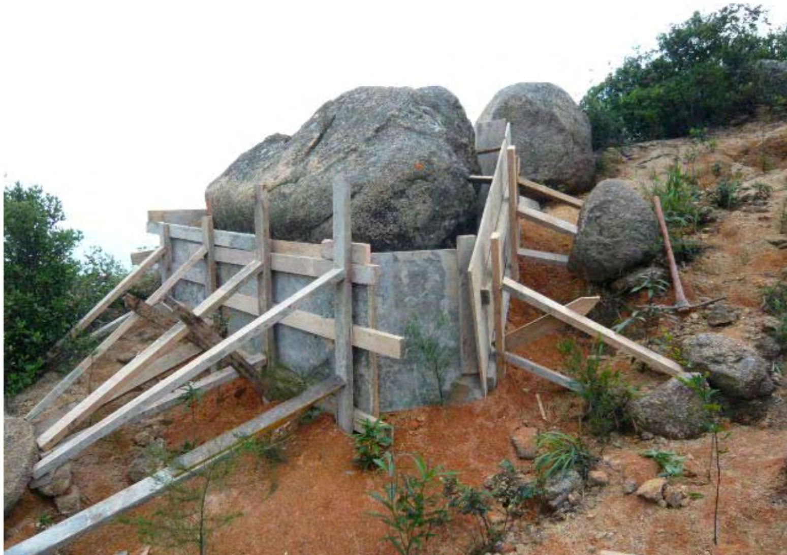
Boulder 3 - Stabilization Works in Progress (Formwork Erected)