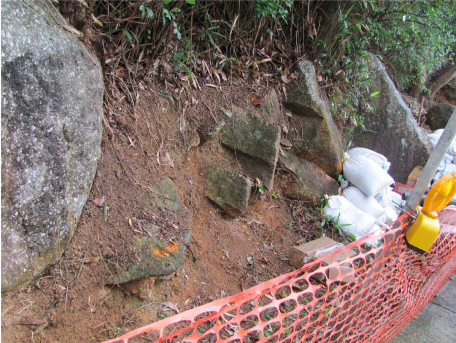
Small Boulders on man-made slopes