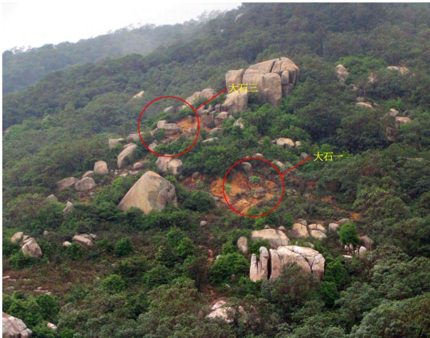
A closer view of Western Natural Hillside