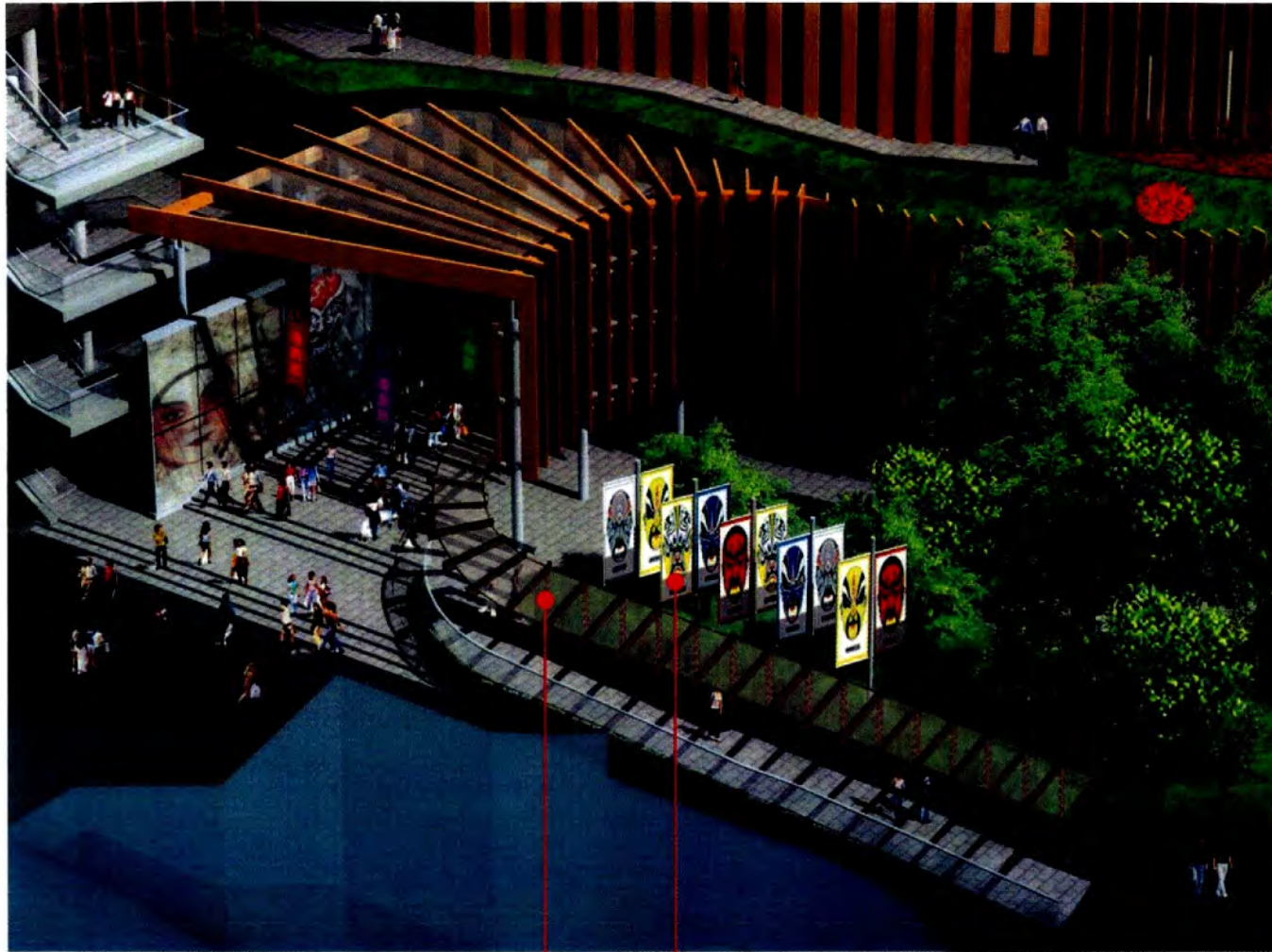
沿入口坡道 增設遮蓋 Addition of cover along entrance ramp