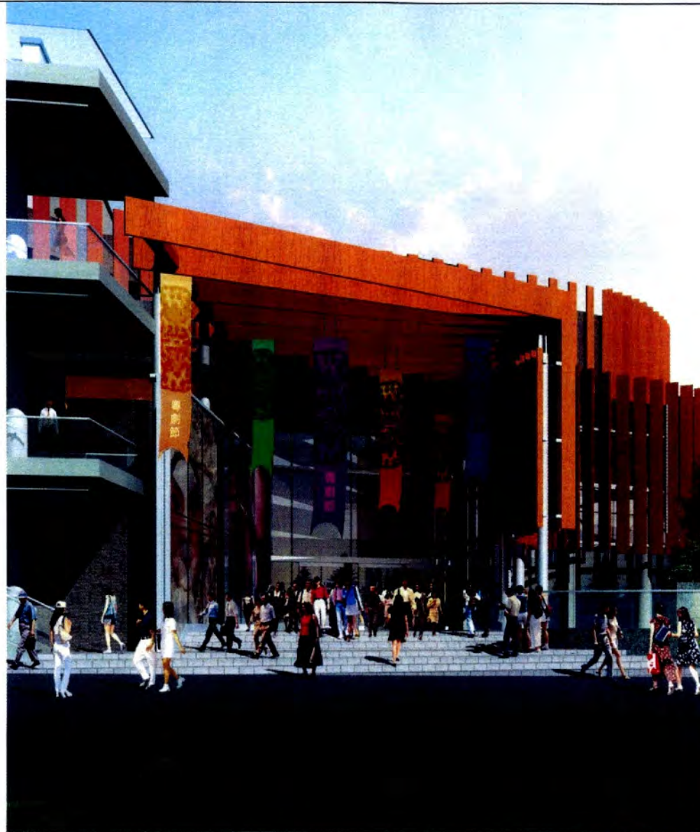
MAIN ENTRANCE OF THE ANNEX BUILDING (ELEVATION) 高山劇場新翼正門入口立面圖

59RE CONSTRUCTION OF AN ANNEX BUILDING AT THE KO SHAN THEATRE 高山劇場興建新翼大樓工程計劃