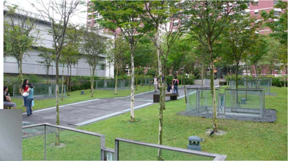
Underground columbarium in a park setting Church of St. Mary of the Angels, Singapore