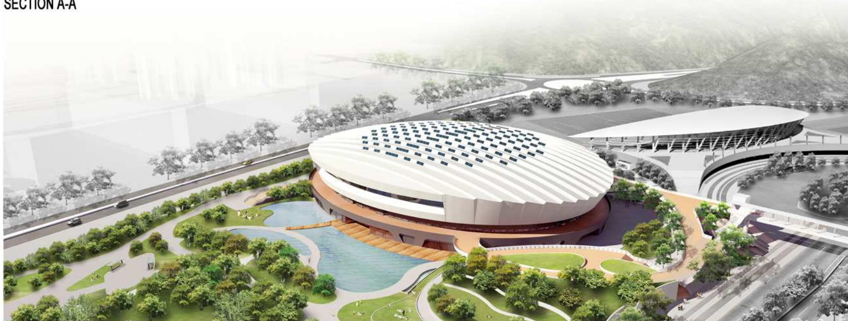
西面鳥瞰圖 AERIAL VIEW FROM WESTERN DIRECTION (ARTIST'S IMPRESSION)