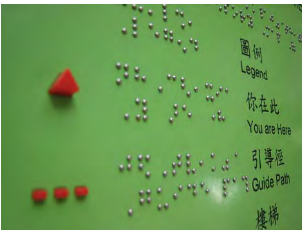
(c) Tactile and Braille message for people with no vision