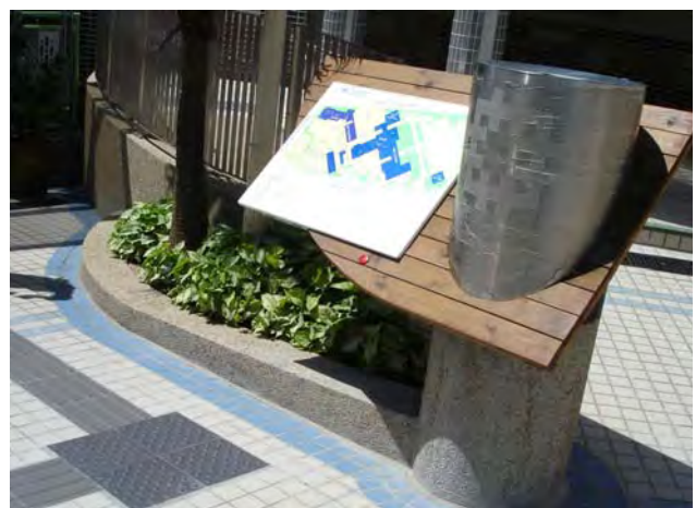
(d) Voice messages activated by pressing the button to indicate the route of tactile guide path to major estate facilities for people who cannot read Braille