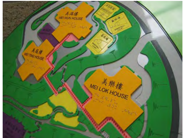
(b) High contrasting colour display for the low vision