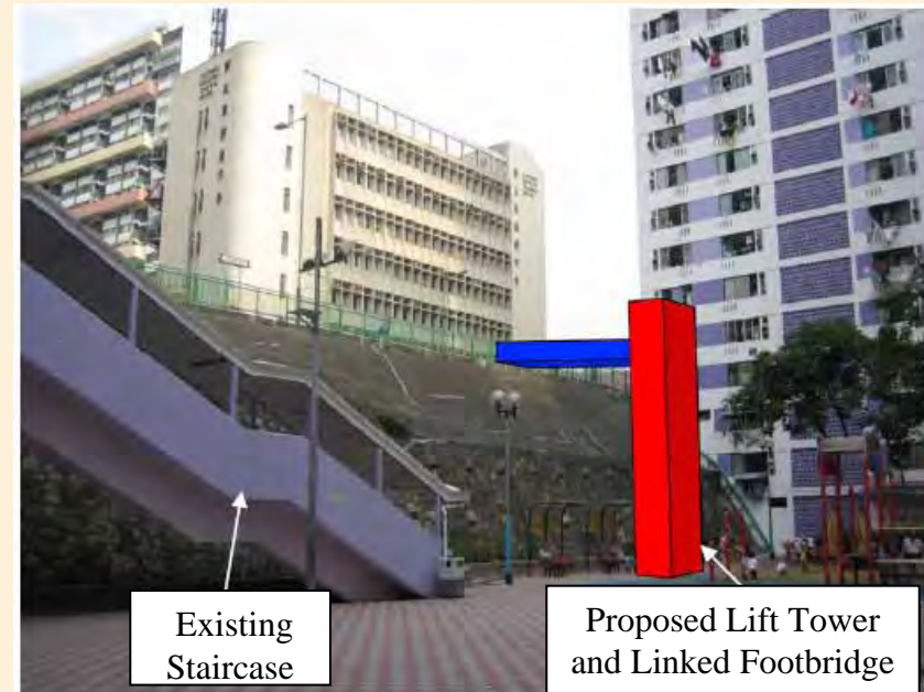
Lai King Estate