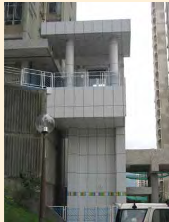
Kwai Shing East Estate