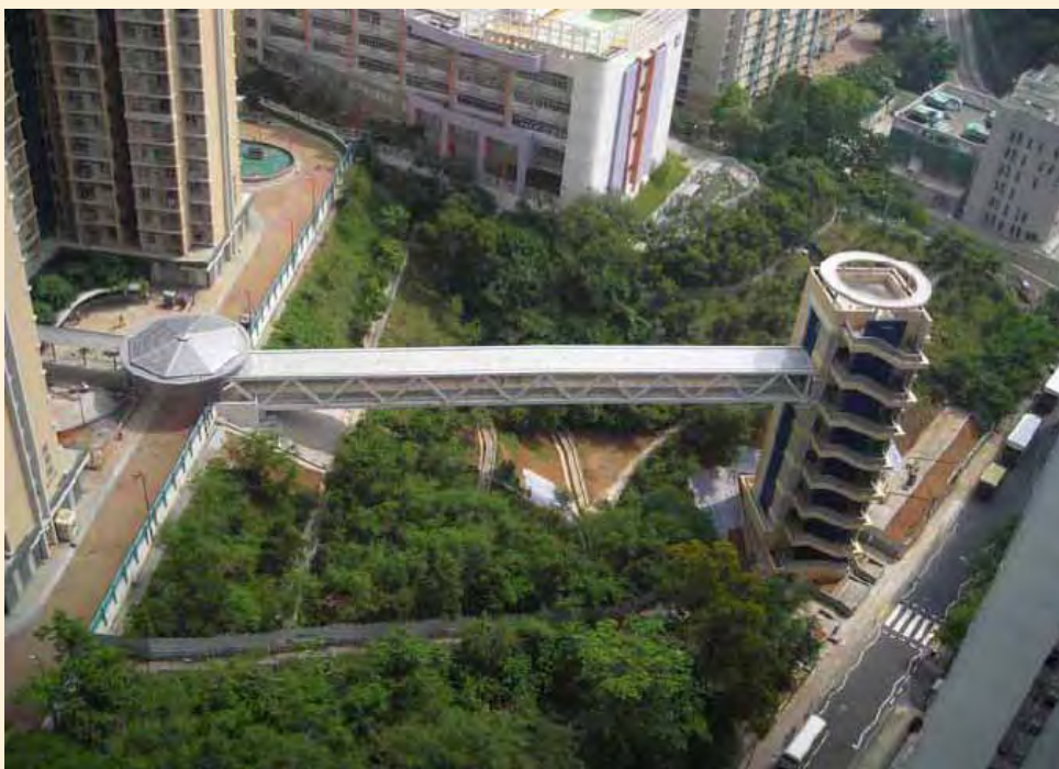
Kwai Chung Estate