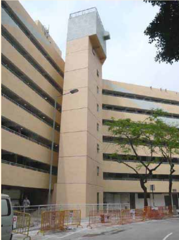
Completed -Tai Hing Estate