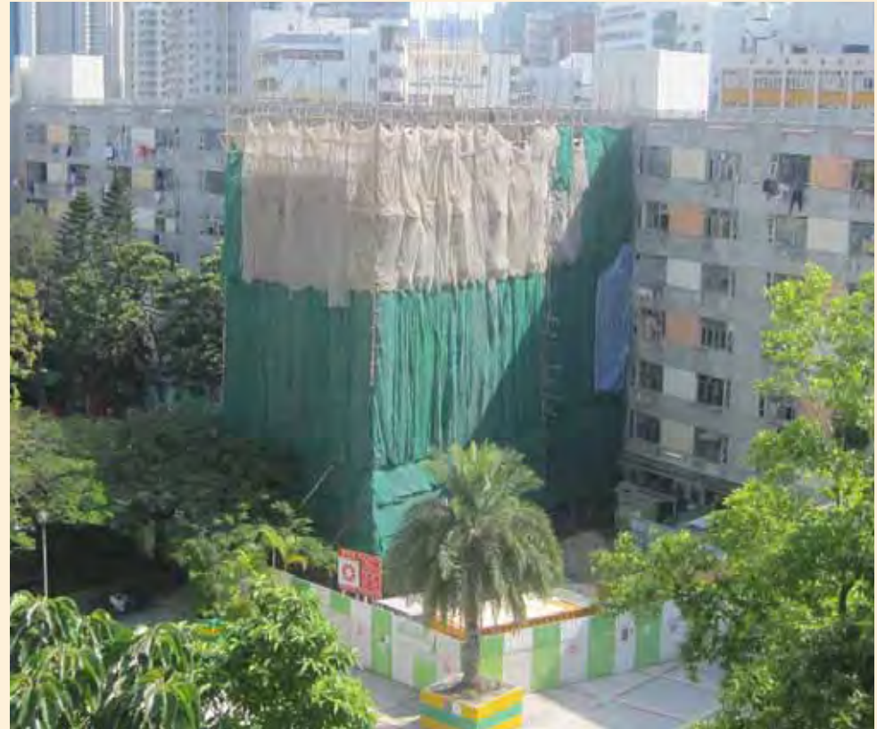
Under Construction -Yue Wan Estate