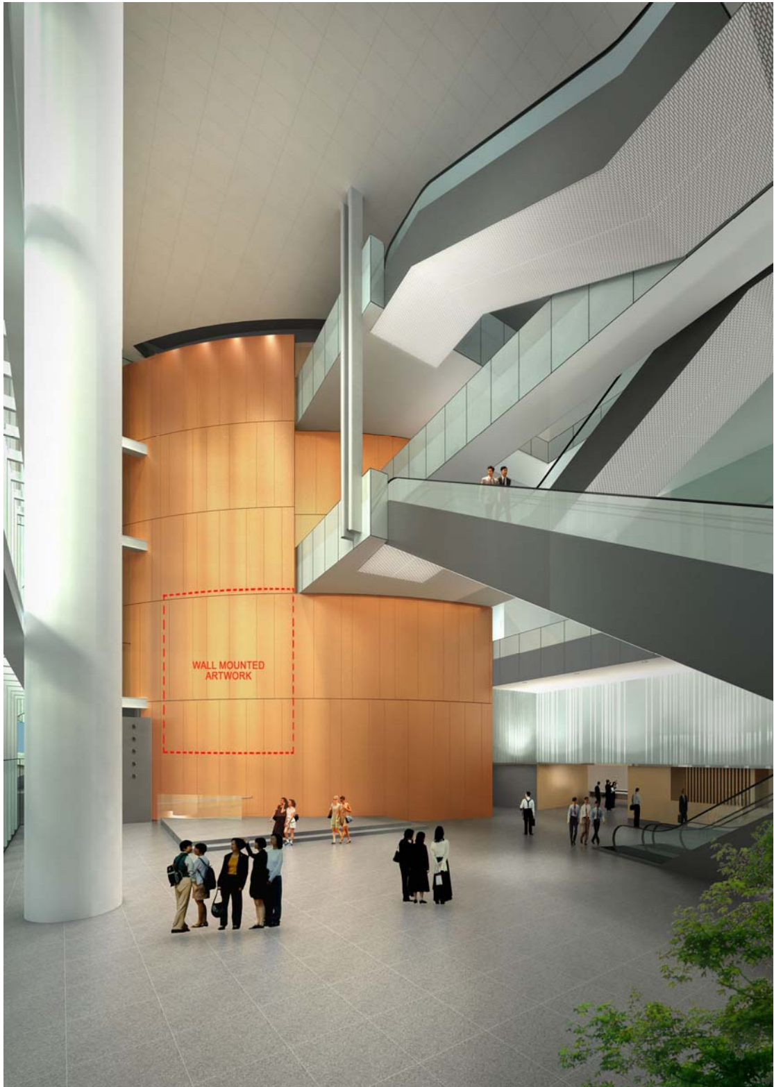
Location on the drum wall in Main Lobby of Council Block for displaying artwork