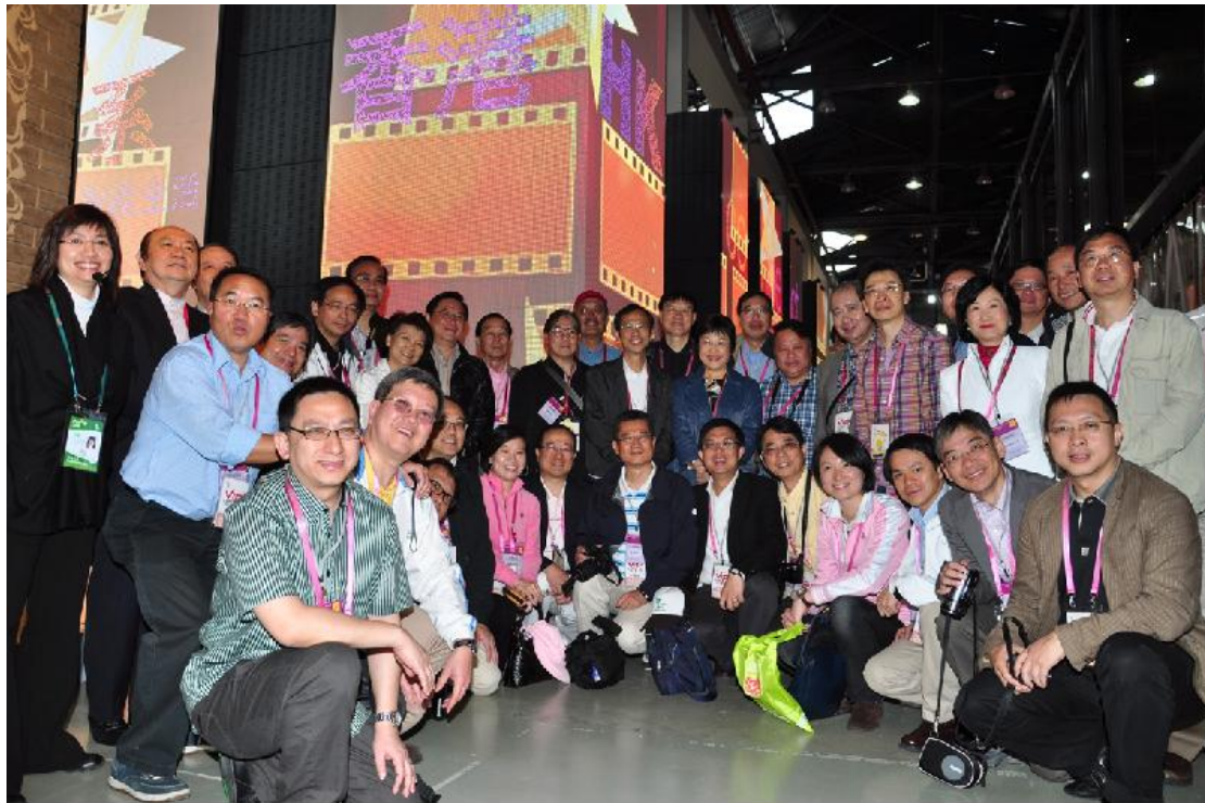
Members of the LegCo Delegation to Shanghai World Expo take a group photo inside the Hong Kong's Urban Best Practices Area.