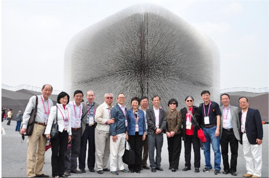
Some Members of the Delegation pose in front of the United Kingdom Pavilion.