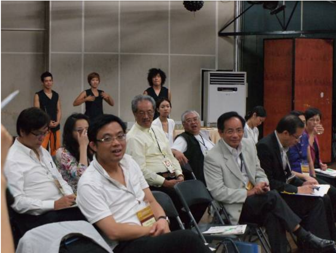
The delegation enjoys an arts performance at the Noridan & Haja Foundation.