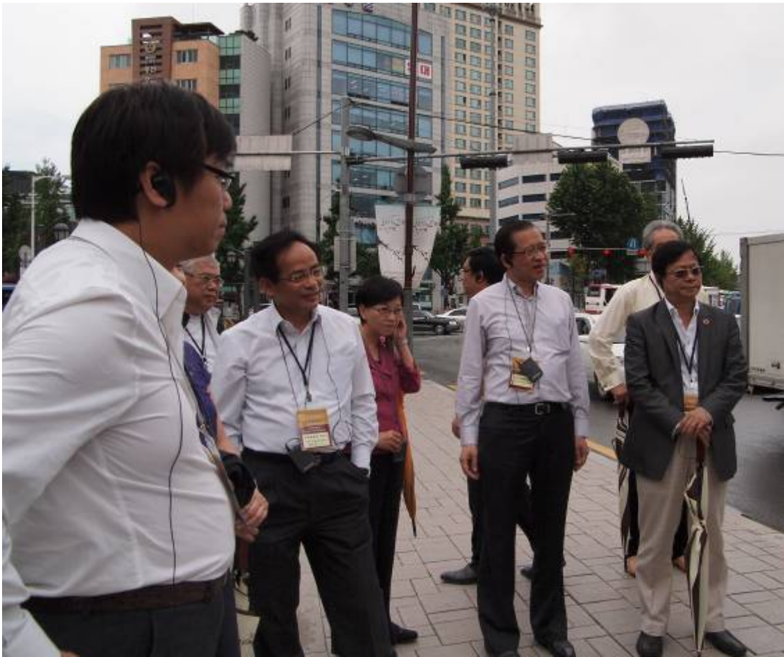
The delegation received a briefing before touring the Insa-dong Cultural District.