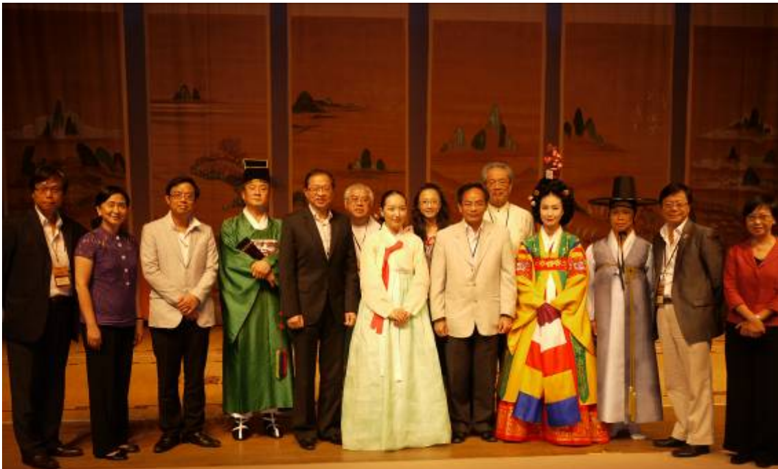
Group photo of the delegation and artists performing traditional music and dance at the National Centre for Korean Traditional Performing Arts.