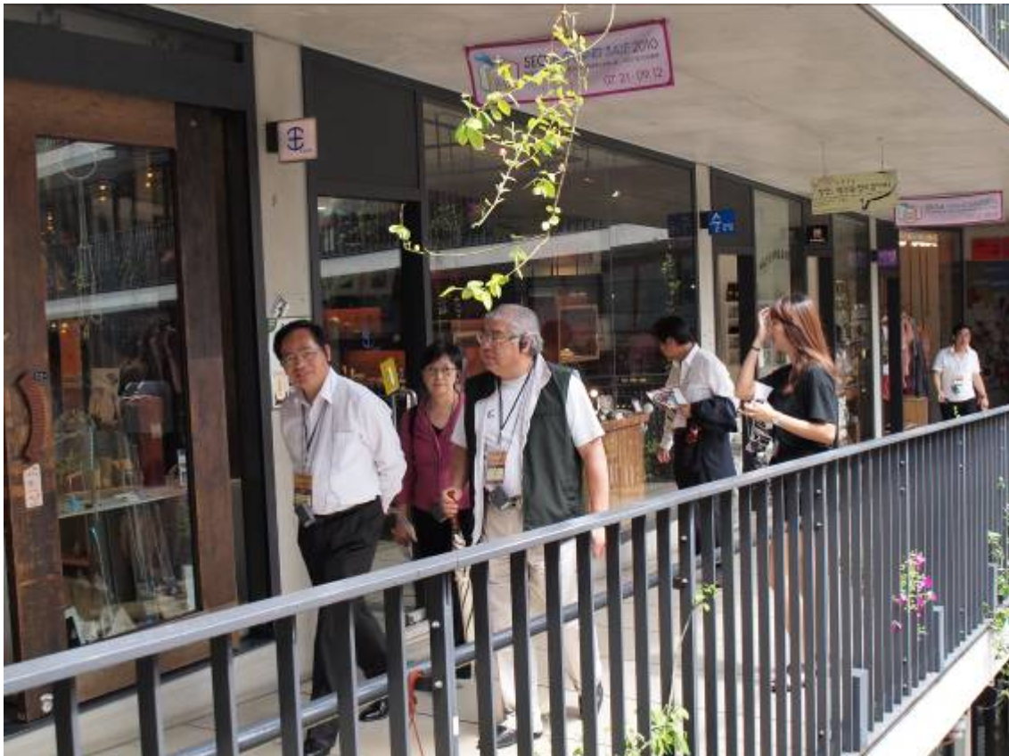
The delegation tours the Insa-dong Cultural District.