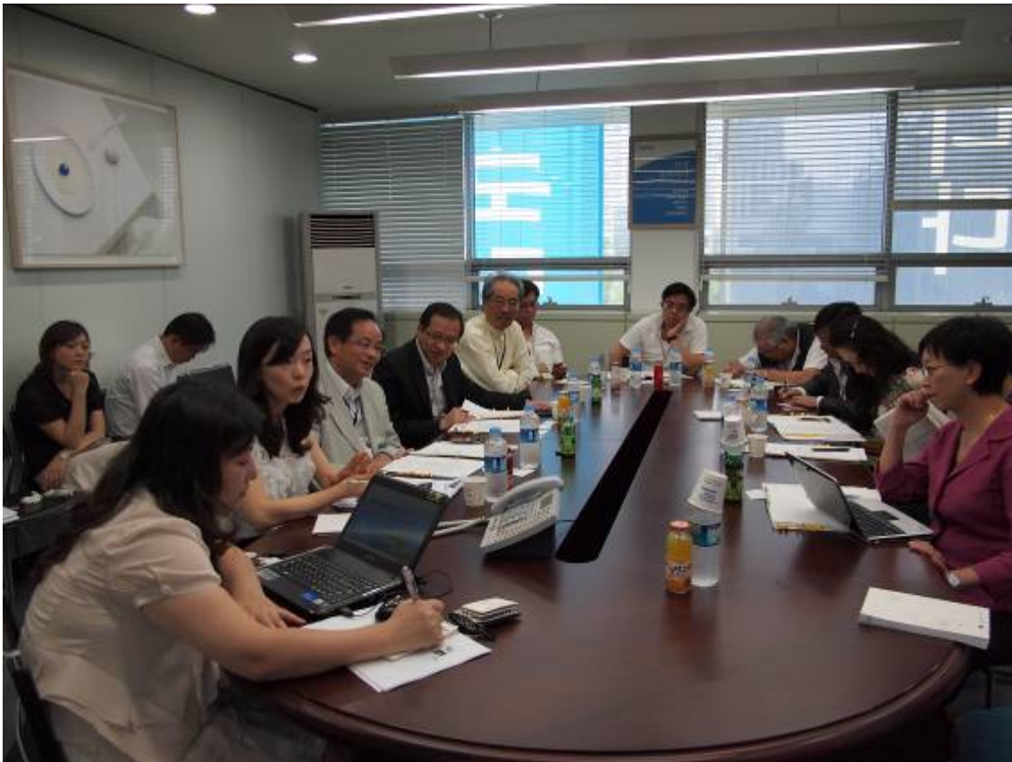
The delegation visits the Ministry of Culture, Sports and Tourism.