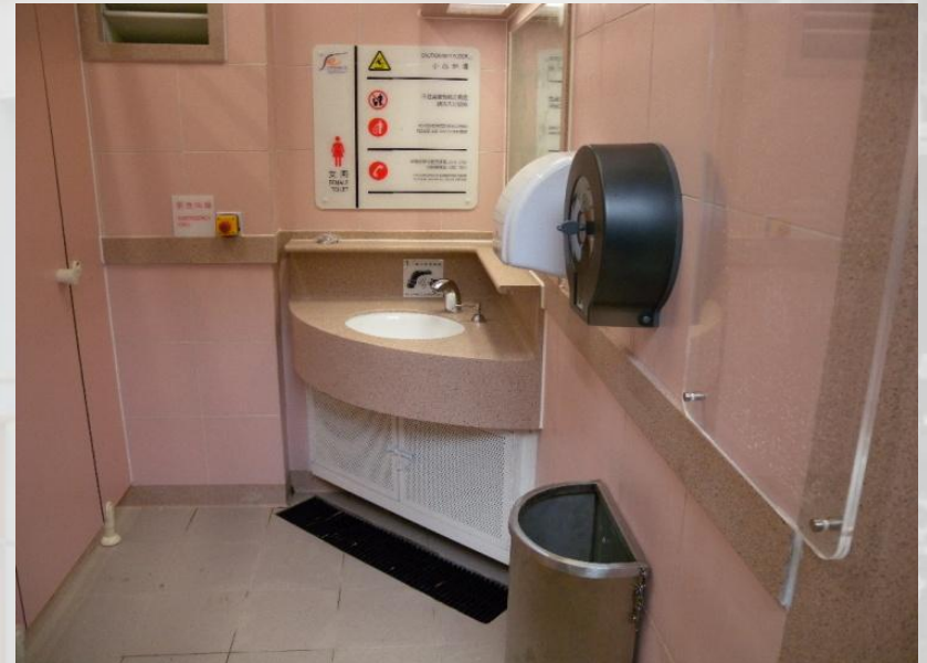
改善後 After Improvement