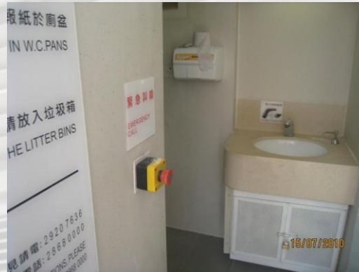
呼救按鈕 Call button