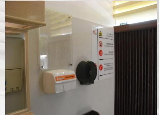
乾手機 Hand dryer