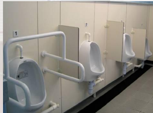
為長者所設的扶手 Hand rail for aged