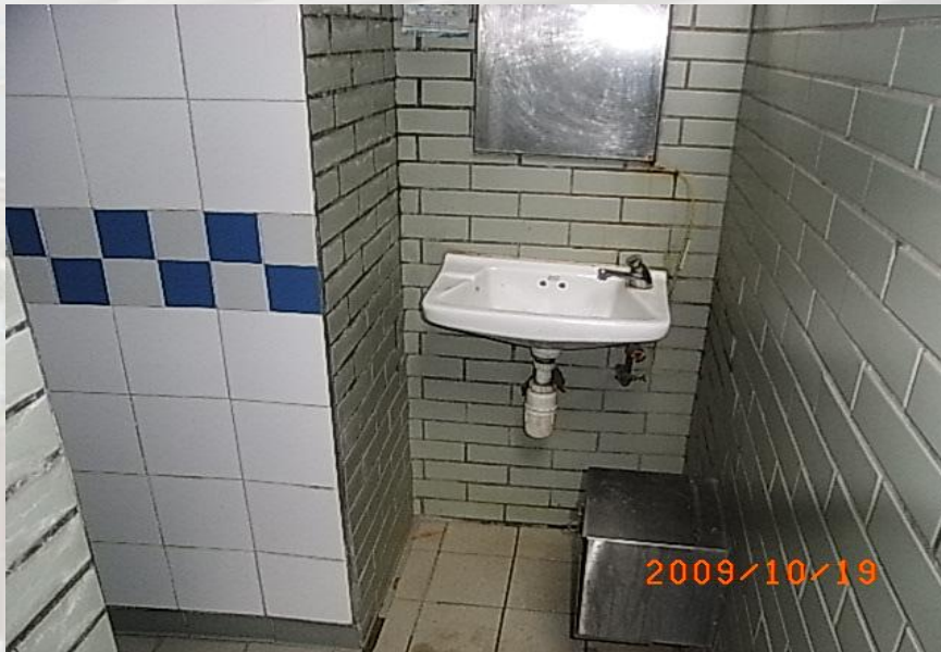
改善前 Before Improvement