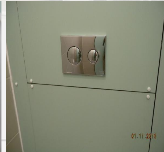
雙沖水量控制 Dual flush control