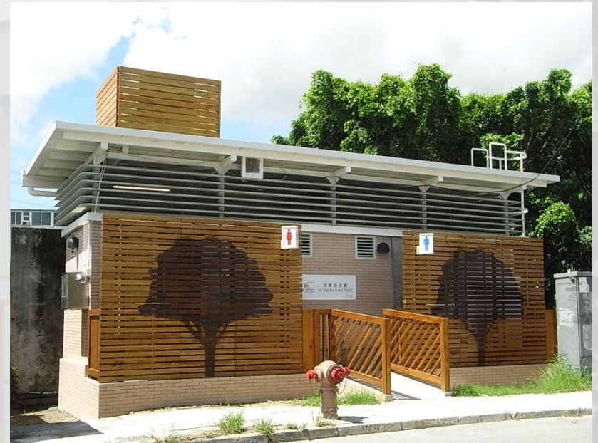
改善後 After Improvement