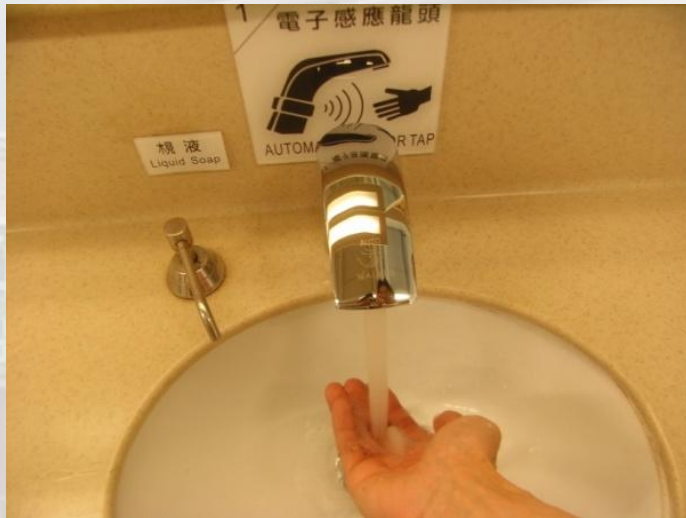
感應式水龍頭 Sensor type tap