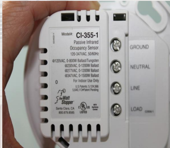
感應式燈光控制 Occupancy sensor control for lighting