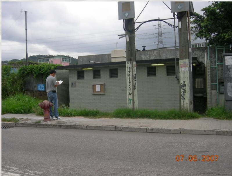
改善前 Before Improvement