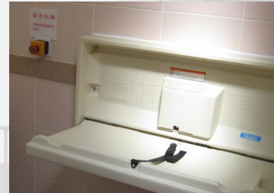
嬰兒換尿片枱 Baby changing counter