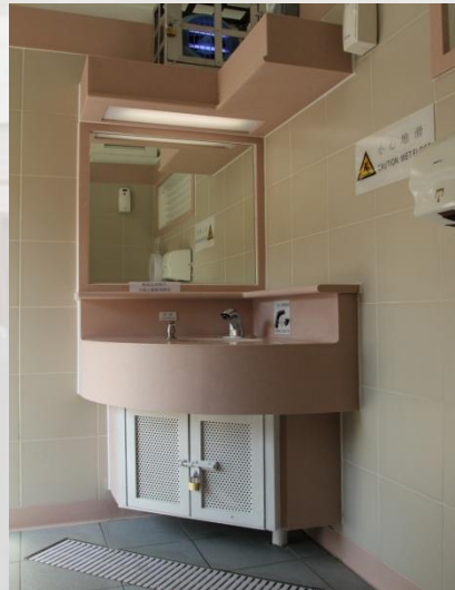
改善後 After Improvement