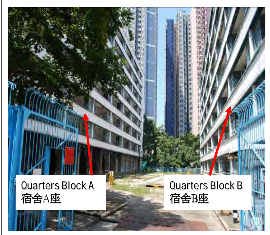
Central Courtyard Inside Elevation 中庭的內視立面