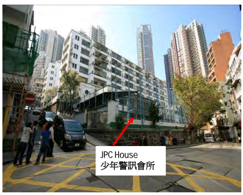
Uphill Elevation on Hollywood Road 從荷李活道上望的仰視立面