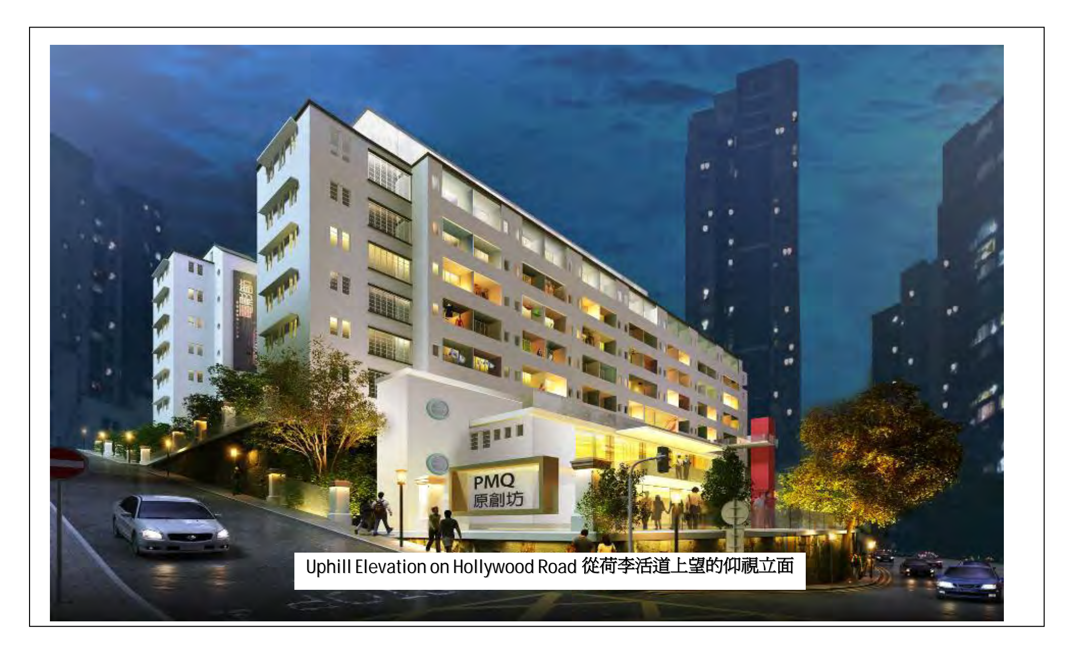
Artistic Impressions of the "PMQ" Project 活化後的「原創坊」項目模擬圖