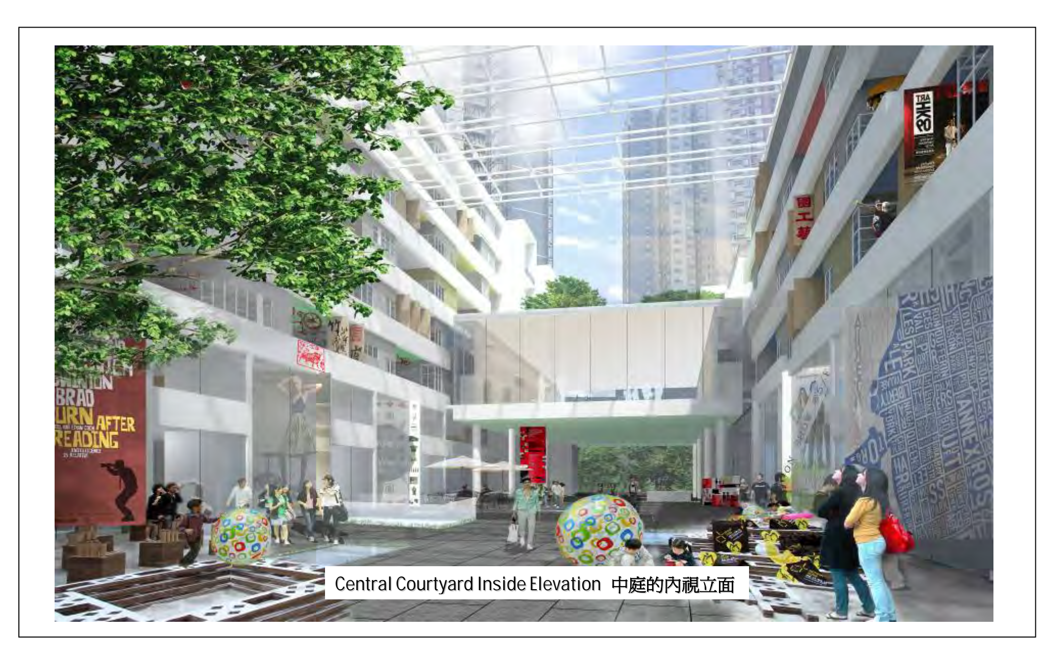
Artistic Impressions of the "PMQ" Project 活化後的「原創坊」項目模擬圖