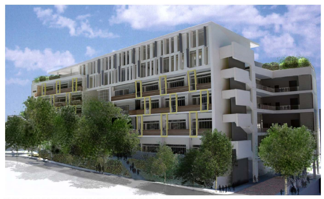
VIEW OF THE NEW SCHOOL PREMISES FROM PERTH STREET 從巴富街望向校舍構思圖