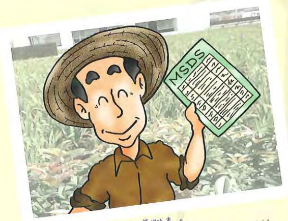
帝備陈亳劑物湖宏全資料表。 Noterial Safety Data Sheet (NSDS) of pesticides shauld be available.

不宜購買過多保定劑。 Ruchase and keep only the arrant of pesticides required for operational needs.