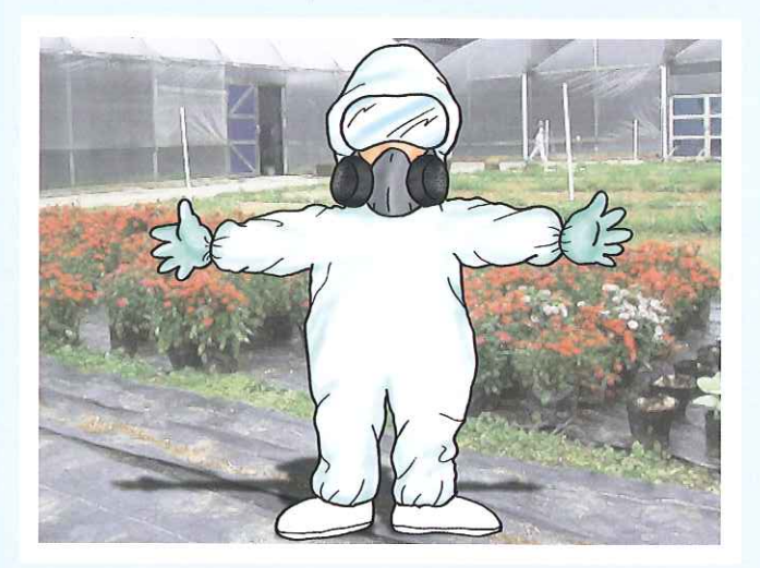
採用標嚴捐増的個人妄全裝備。 Wear appropriate personal protective equipment (PPE).