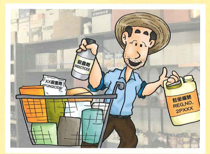
已選購已發冊、包裝妥當及阿有合格標戰的產品。 Purchase only properly packed, labeled and registered pesticides.

閱讀及遵追標嚴上的有引。 Read and follow labeling instructions after use.