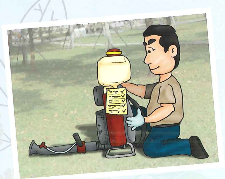
兔期檢查、維修及適當調枝噴霧器。 Provide proper calibration, maintenance and regular checking.