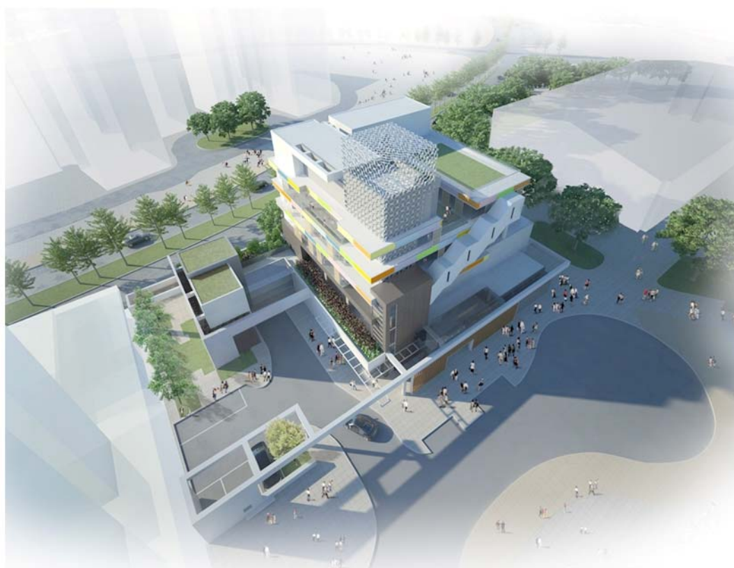
從西面望向綜合大樓的鳥瞰圖 BIRD'S EYE VIEW OF THE PROPOSED DEVELOPMENT FROM WESTERN DIRECTION (ARTIST'S IMPRESSION)