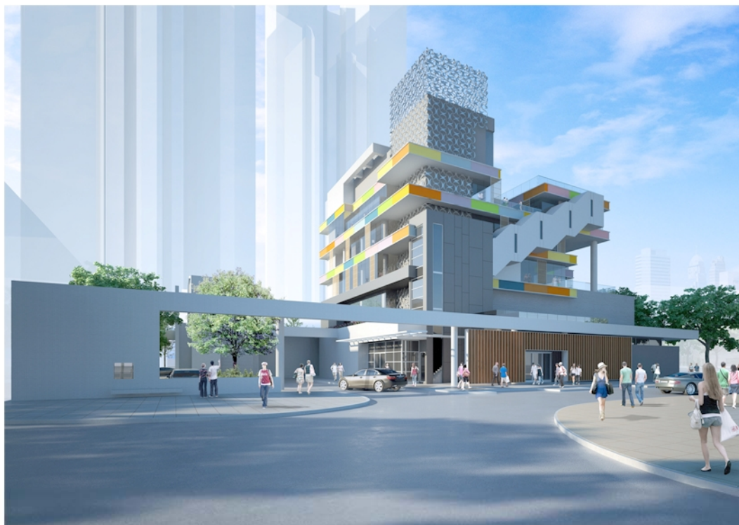
從西面望向綜合大樓的構思圖 VIEW OF THE PROPOSED DEVELOPMENT FROM WESTERN DIRECTION (ARTIST'S IMPRESSION)