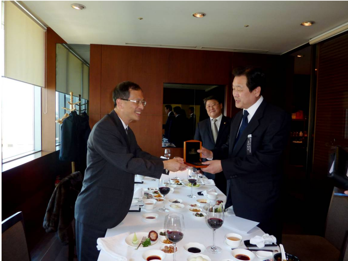
Hon Jasper TSANG Yok-sing, President of the Legislative Council, attends a lunch hosted by Mr Kim Moo-sung, President of the Korea-China Inter-Parliamentary Council, during the visit in the Republic of Korea. Mr TSANG presents a souvenir to Mr Kim during the lunch.