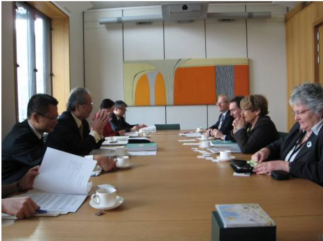
The LegCo PAC's delegation to United Kingdom meets with the Public Accounts Committee of the House of Commons, United Kingdom Parliament to exchange views on the Committee's work.