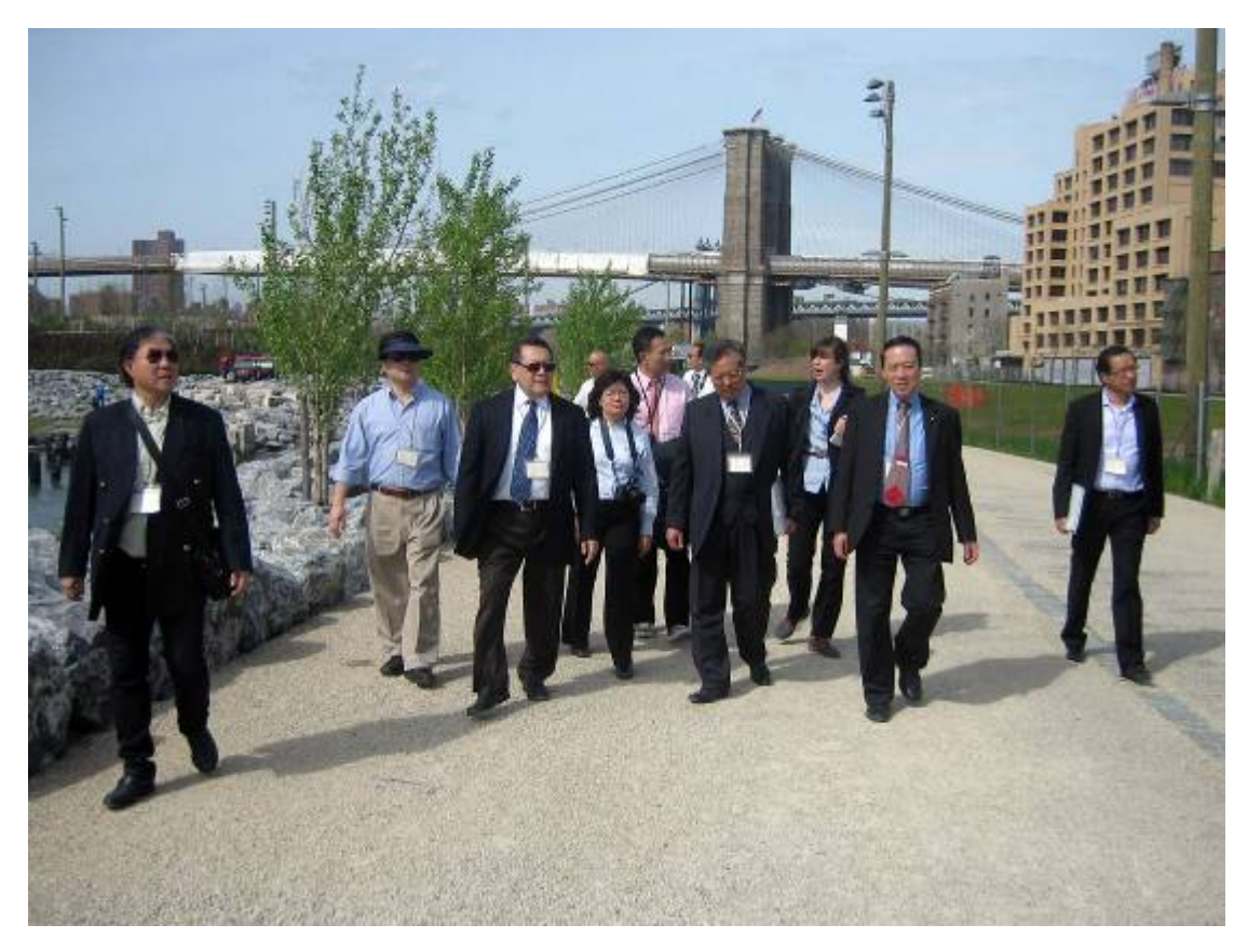
Members of the delegation visit the Brooklyn Bridge Park in New York.