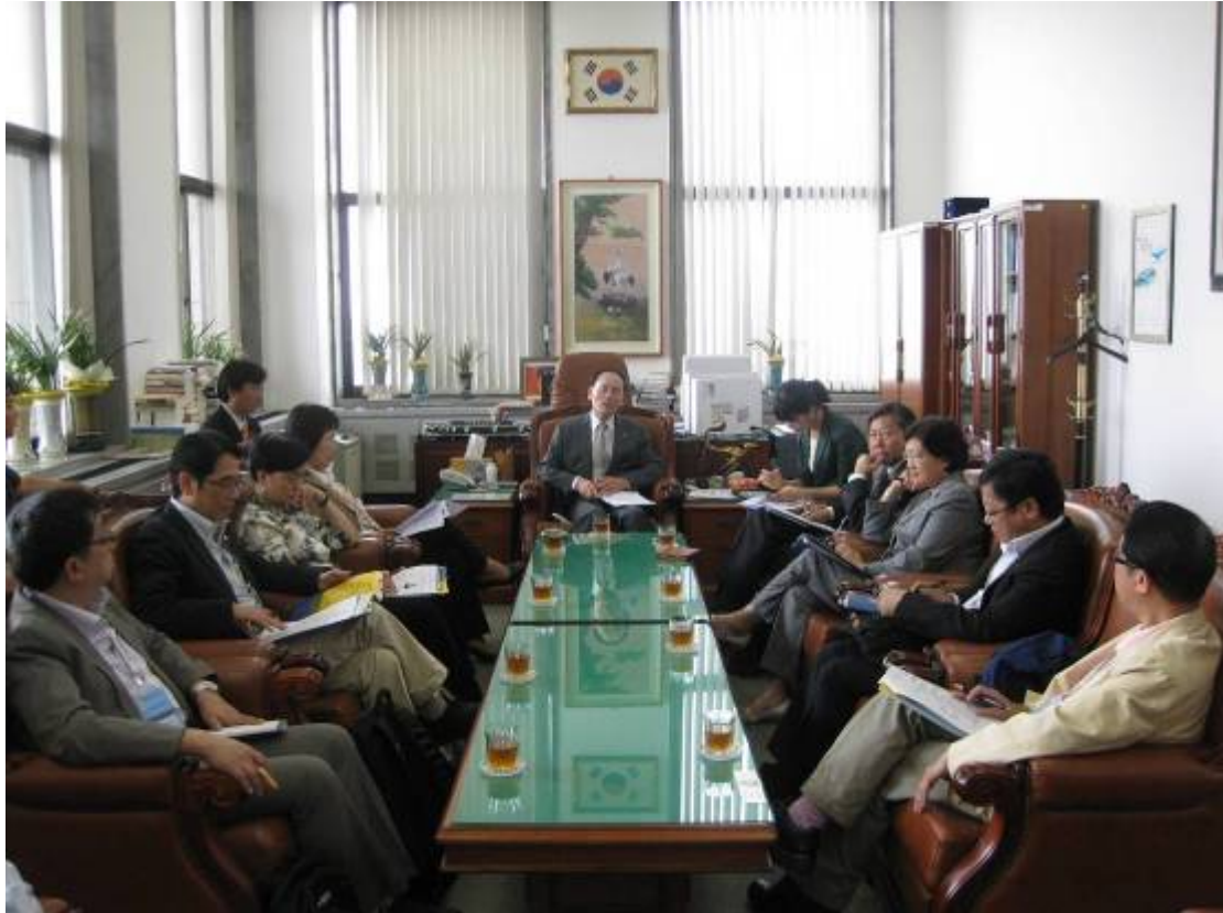
The delegation meets with the Environment and Labor Committee of the National Assembly.